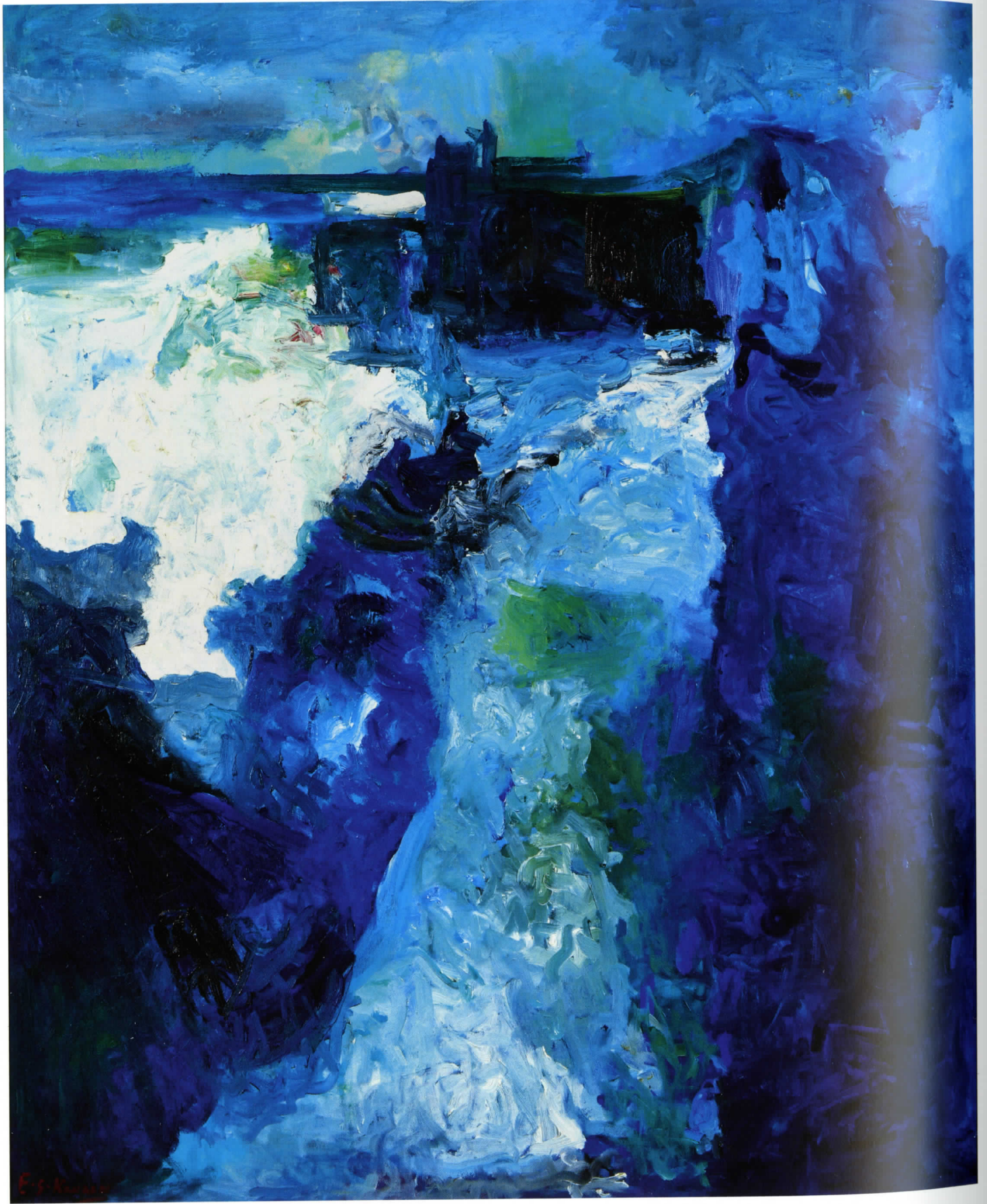
The Mediterranean c. 1994 Oil on canvas 100 x 80 cm (39.4 x 31.5 in.) Ramzi and Afaf Saïdi Collection