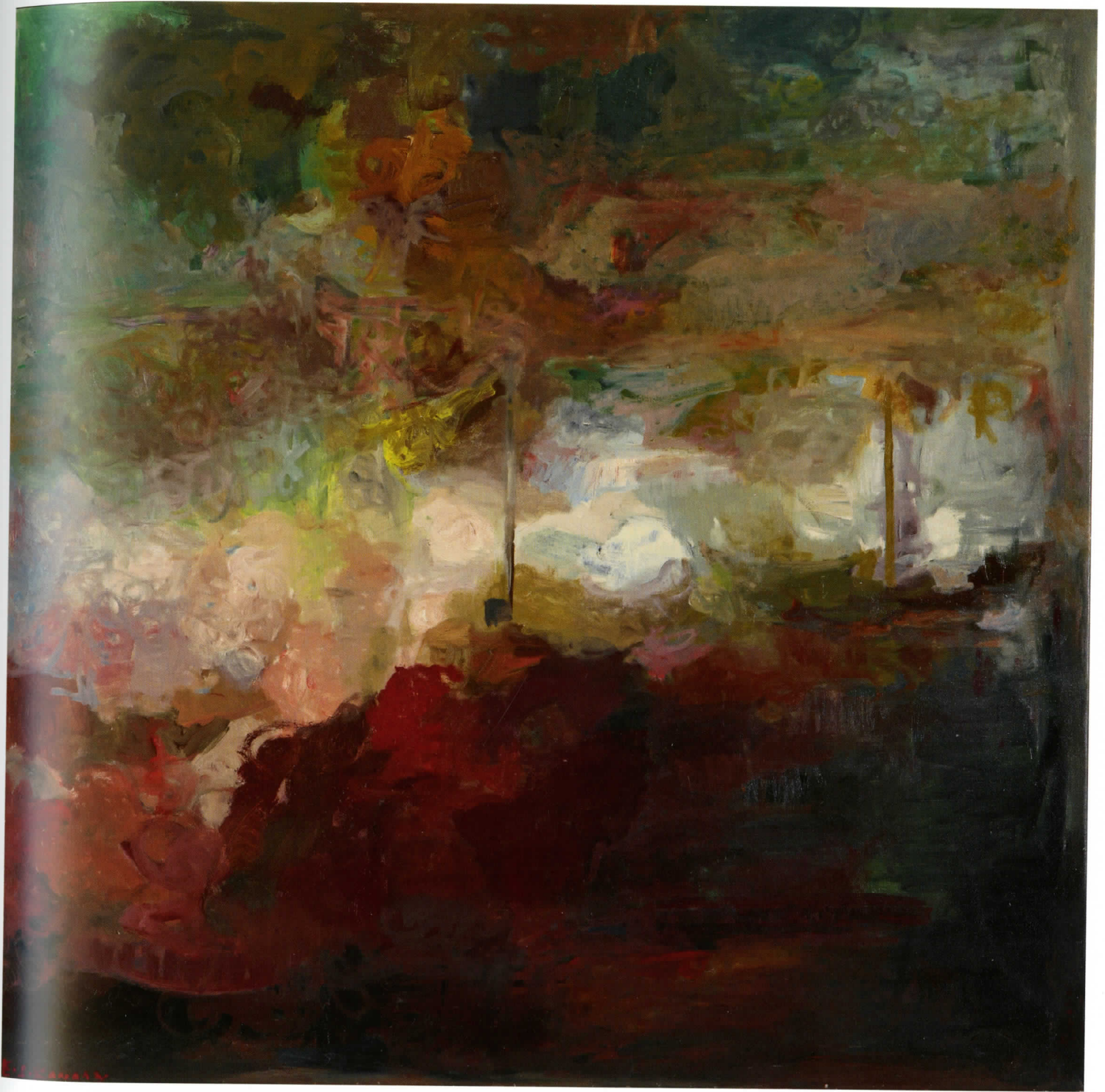
The Beacons of Dinar