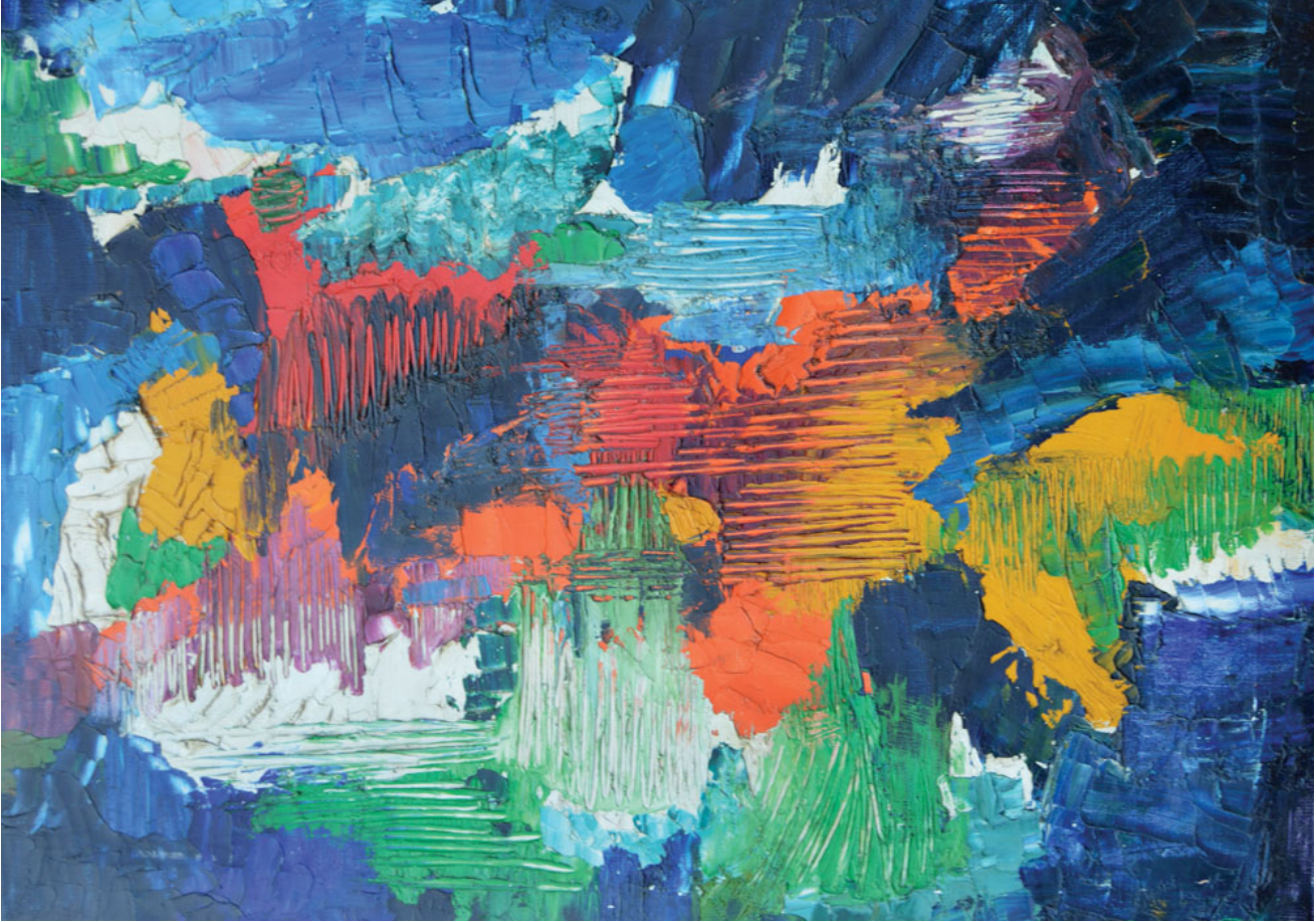
Samia Taktak Zaru, Untitled, 1976

Contemporary represented the largest section of exhibitors, with 76 galleries from 36 countries and spanning from some of the world's most influential institutions to dynamic, up-and-coming spaces. Trendesign's top pick? Russian artist Olya Kroytor's Situations series that was on show at the Moscow-based Artwin Gallery's booth. Kroytor's complex works combine geometric abstraction, collage and comics with 3D objects and counter-reliefs that eschew traditional painting techniques.