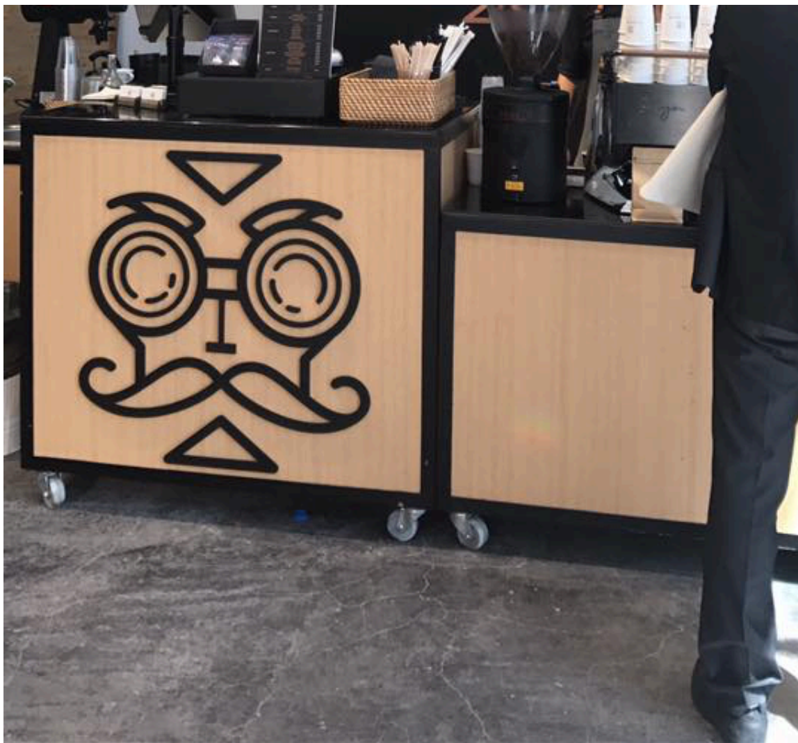
Blacksmith coffee

Visit Warehouse421 for additional informations.