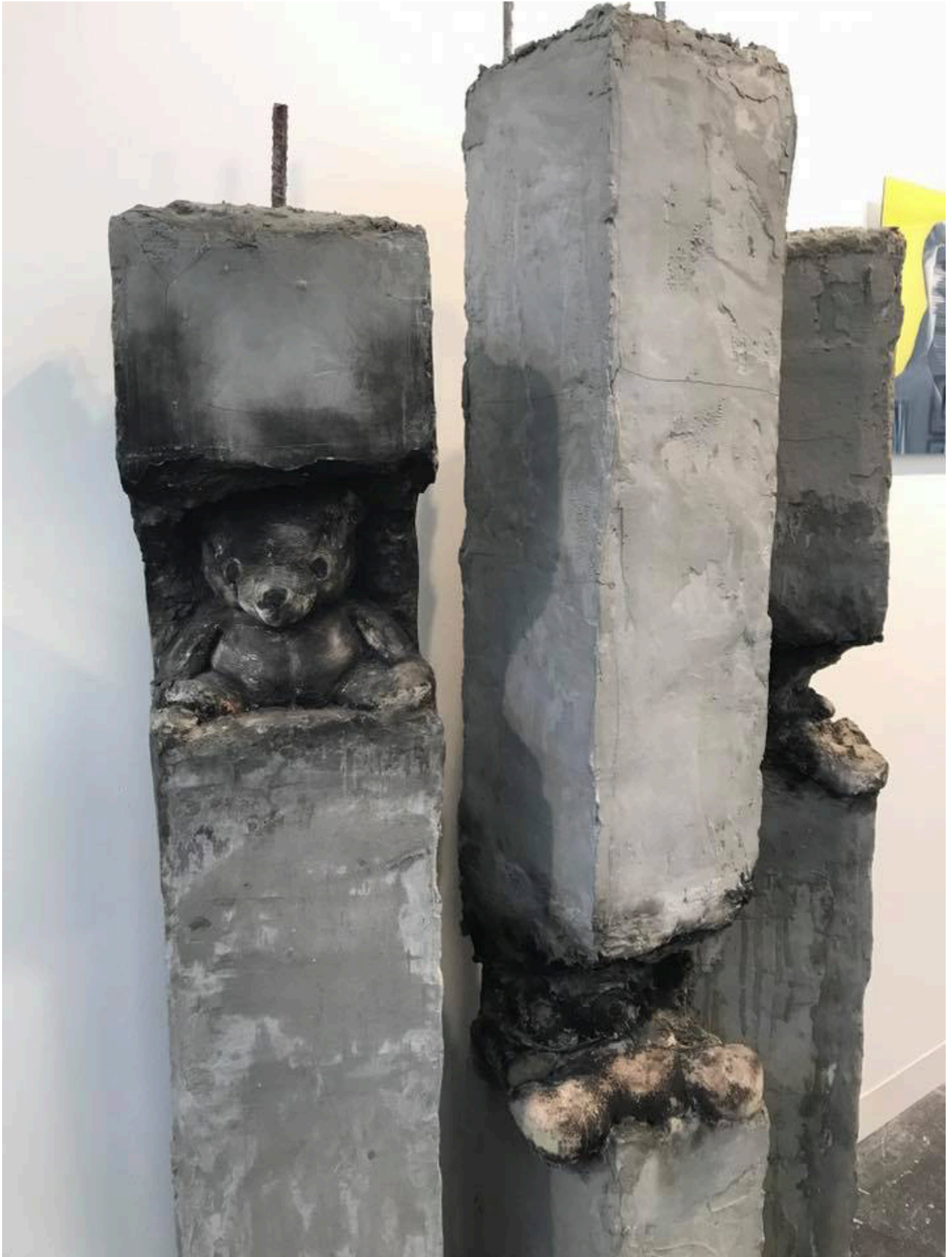
"Concrete" by Alaa Mahmoud Alqedra