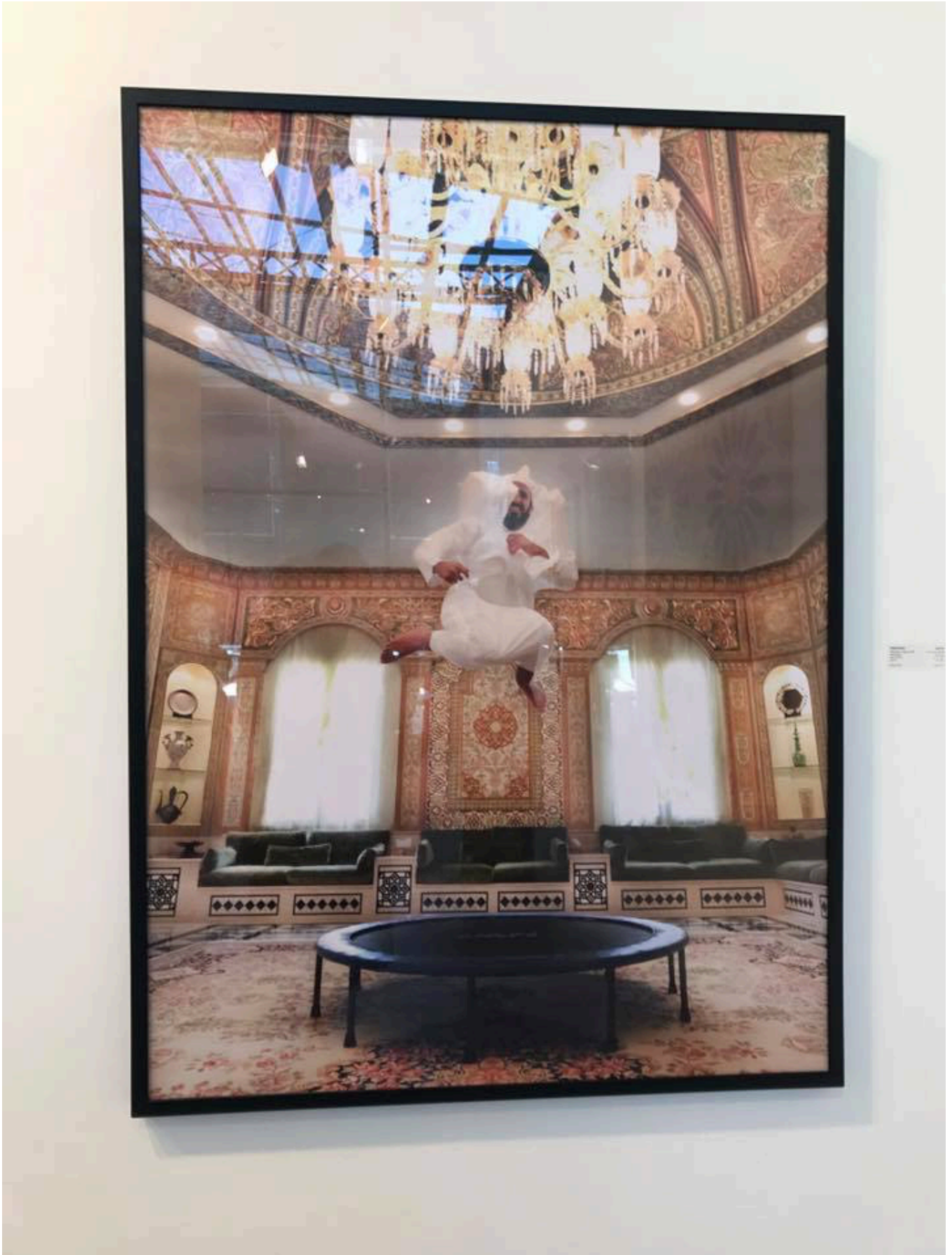
“The Simplicity of Islam” Khalid Zahid