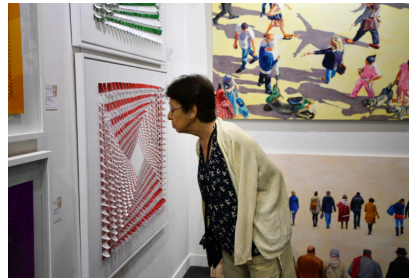
A curious visitor inspect a painting

When foreign journalists flock to Beirut it can be cause for alarm, but an increasingly compelling annual art tradition is attracting more and more press to Lebanon for all the right reasons. Over 20 international journalists, as well as artists, gallerists, collectors, experts and others in the industry flew in from around the world for the 7th edition of the Beirut Art Fair, to discover Lebanon's rich artistic heritage, quickly-expanding art scene and its growing potential as an international destination for art – much to the delight of local hotels, several of which were reportedly at capacity during the busy week.