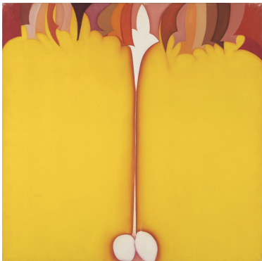
Huguette Caland's work is said to contain more subtle eroticism than some of her contemporaries

The selection is not only a display of beautiful works by prominent artists, but also “a move towards the broader public recognition of creations by women,” according to BAF Artistic Director Pascal Odille, who emphatically praised the work of these strong, forward-thinking women that marked Lebanon’s art scene with their creative energy, but some of whom are still little-known to the general public.