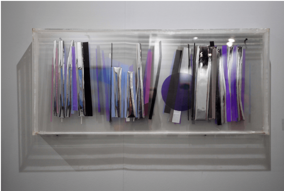
Nadia Saikali's progressive plexiglass art