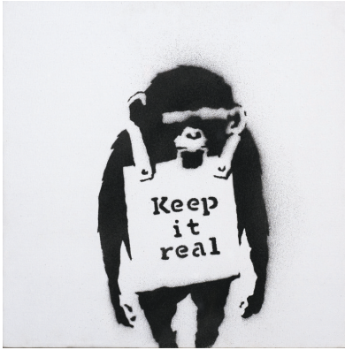
Bel Air Fine Art gallery's artworks include Banksy street art | Courtesy Bel-Air Fine Art, Switzerland, Italy, France, Middle East