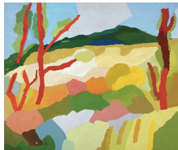
Etel Adnan is a painter and writer