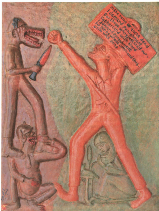
Pablo Neruda series , 1985. Acrylic on sawdust and glue, 75.5 x 57.5 cm