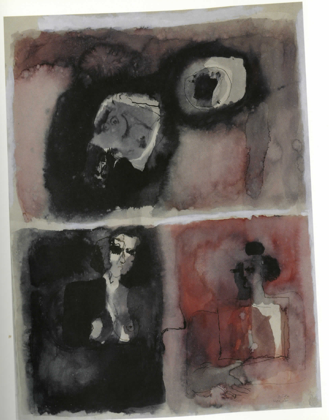
Untitled (1973) Gouache on paper 75 * 51 cm