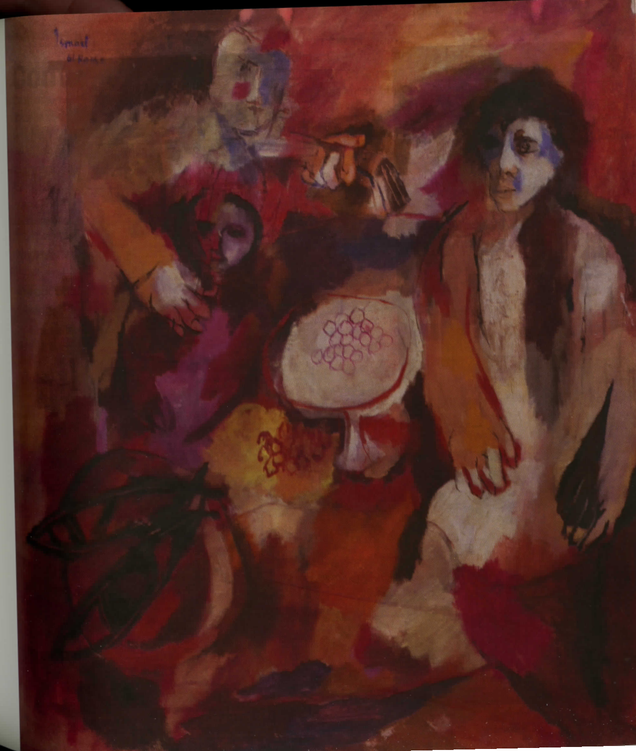
Untitled (1961) Oil on canvas 85 * 70 cm

sculpture and painting, in Rome, Baghdad, London and Beirut. His work is held in Mathaf: Arab Museum of Modern Art, Doha; Kinda Foundation, Saudi Arabia; Darat Al-Funun and Jordan National Gallery of Fine Arts, Amman; and Museum of Modern Art, Baghdad.