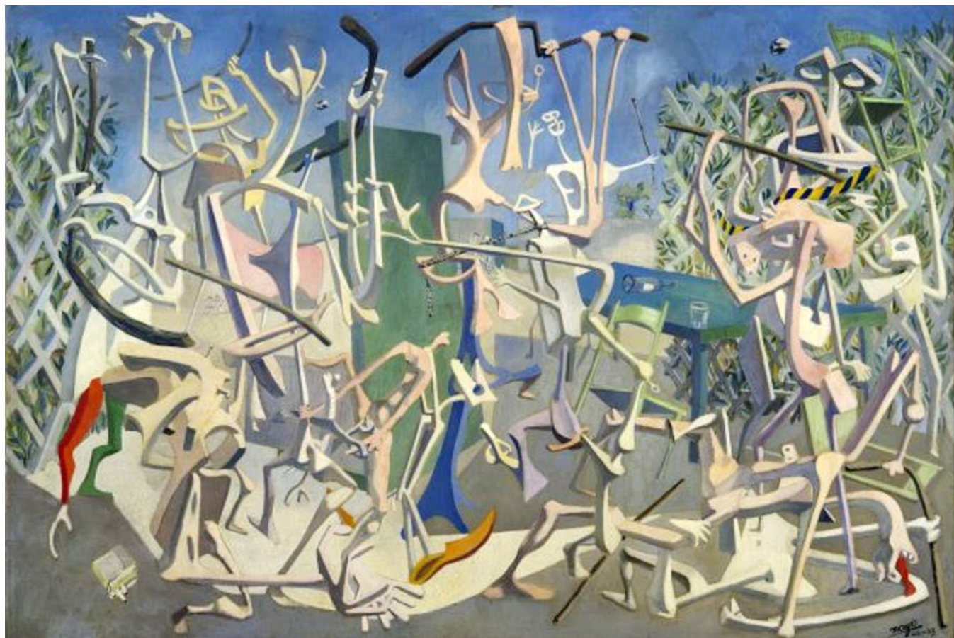
"Coups de Bâtons," 1937, Mayo.

Of Art et Liberté 's thematically curated rooms, "Women of the City" left the most questions unanswered. The room was framed around the active role women played in the group, and aimed to show the artists' critique of prostitution in wartime Cairo. A video of archival photographs and footage played to the "St. Louis Blues," which included a newspaper photograph of belly dancers in gas masks, emblematic of the contradictions of wartime pleasures and objectification.