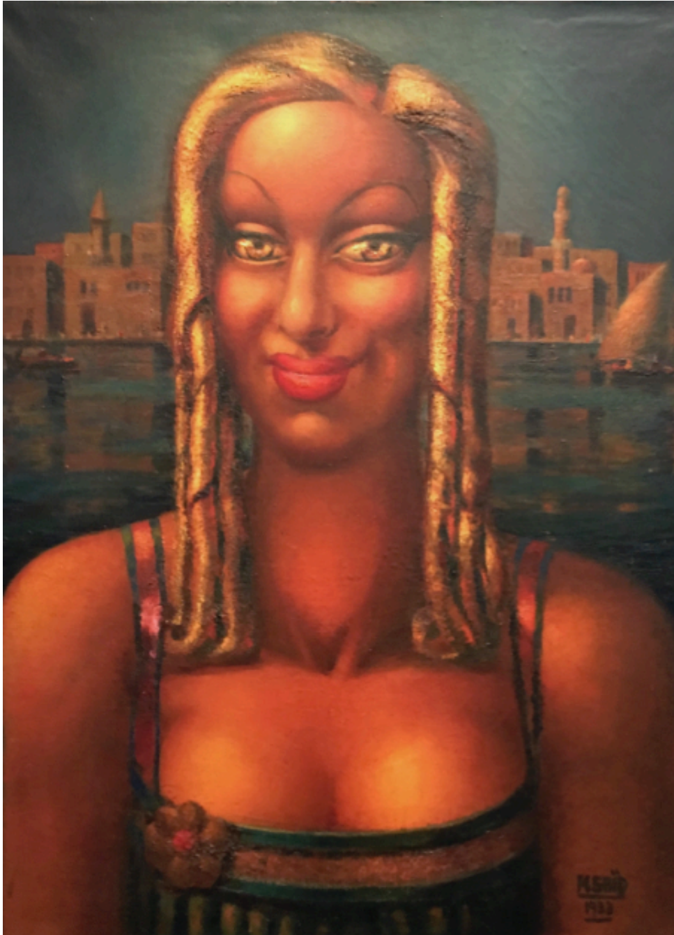
"La Femme aux boucles d'or" (The Woman with Golden Locks), 1933, Mahmoud Said.

exerted a huge influence on their work, and this painting appeared in the group's first exhibition. Gazing into the eyes of Mahmoud Said's iconic prostitute, one longs for commentary on how these paintings contributed to a counter-narrative of empowerment rather than engage in run-of-the-mill objectification.