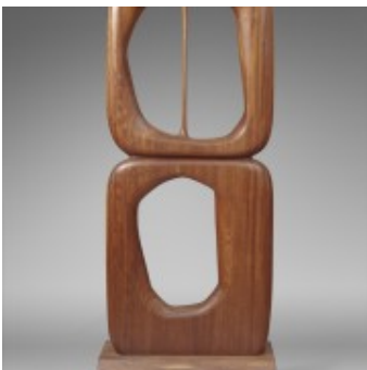
Lyrique, 2006, iroko, 65x10x160cm