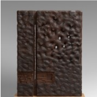
Le mur, bois de wangué, 58x8x76 cm