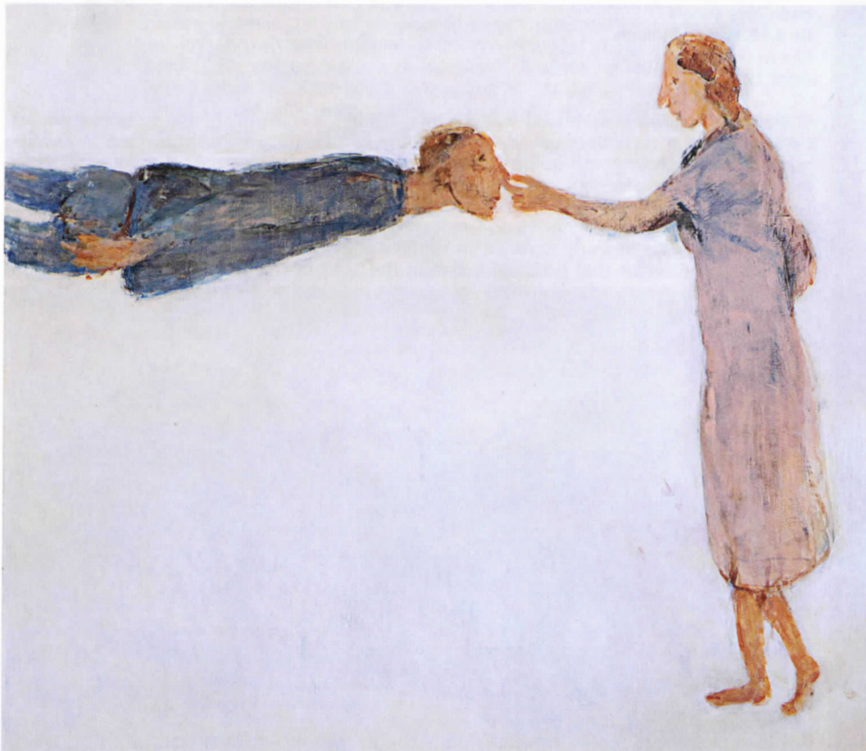
| Nasser Hussein