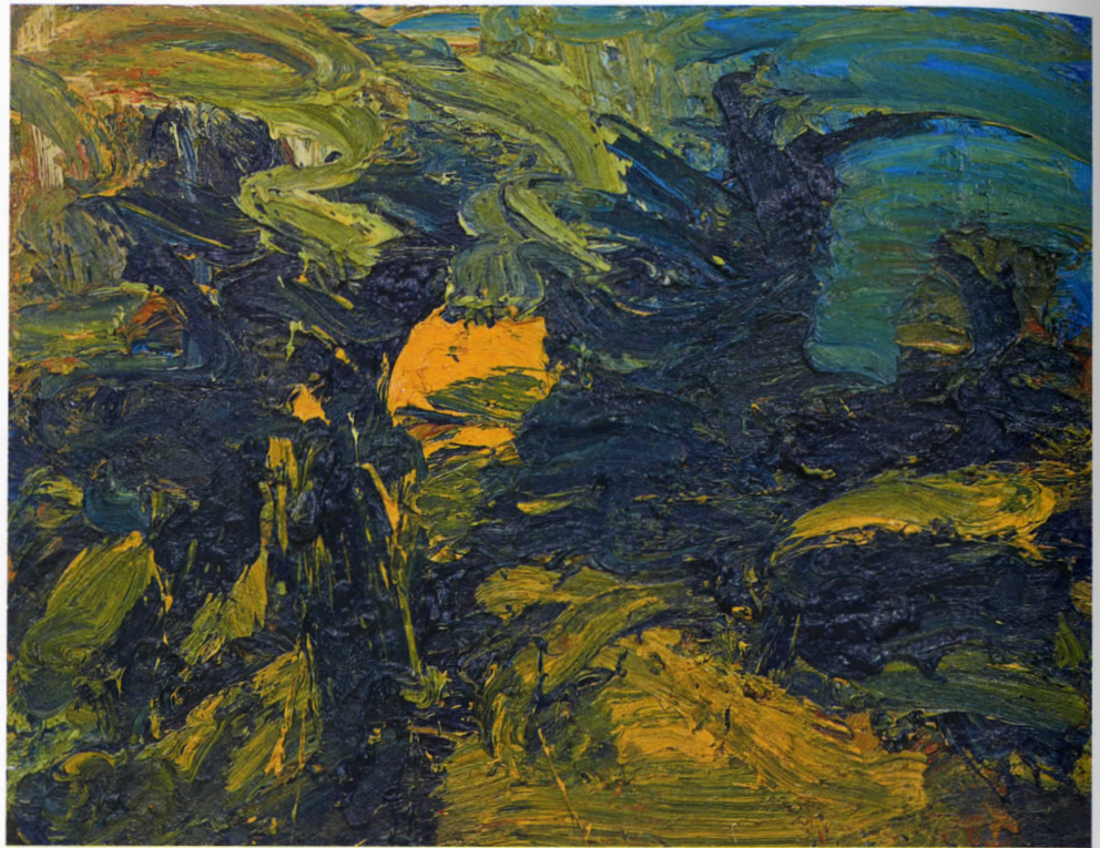
| Nadia Safieddine

This exhibition, according to curator Natasha Gasparian, “invites the viewer to engage in an activity which has been under increasing duress - to look, seriously and quietly, and see.” This rather noble goal was achieved by selecting one work by each participating artist and displaying them together without a clear intent or context. An exhibition that lacks a didactic or expository framework is rare, and the act of thoughtful appreciation widely undervalued. By placing seemingly unrelated works together, the curatorial approach distinguishes itself by valuing observation over explanation. Arguably, the purposeful omission of an overarching narrative does in fact create a structure to the exhibition anyway, so that the lack of a framework is the framework itself. This may be true, but in all cases the intention of the exhibition is refreshing and boldly goes against popular curatorial trends, even if it could be proven contradictory. Each work, some which might be familiar to frequent visitors of Saleh Barakat Gallery, and others that have never been shown, is a testimony to the diverse skill of Lebanon's top artists. By creating the conditions for appreciating the artworks in their singularity, the exhibition also allows for a deeper appreciation of these beloved local artists all under one roof.