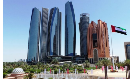
The Land of the Rich: UAE claims 5th in attracting the wealthy