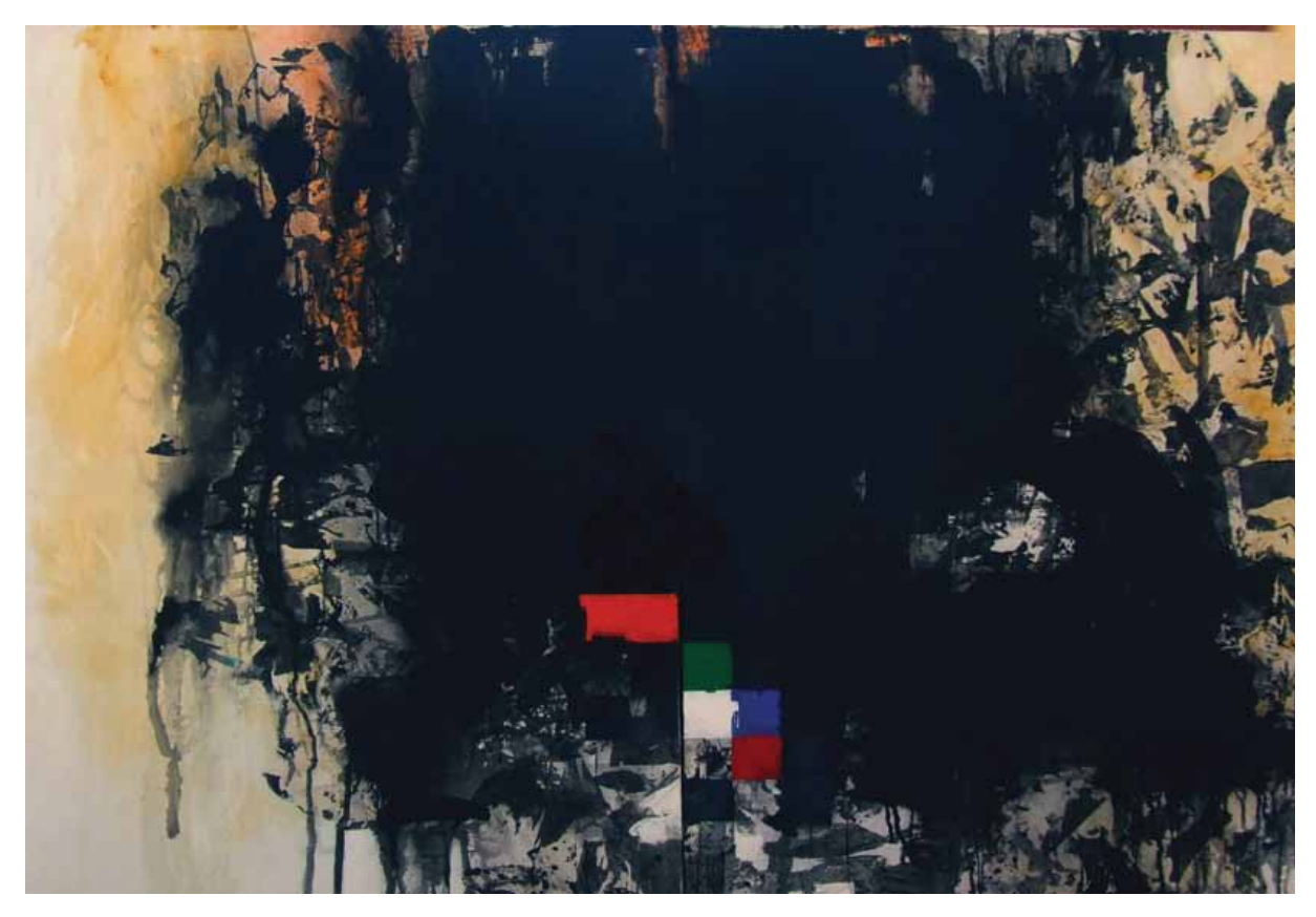
Ghassan Ghaib, Organised Anarchy (2010), mixed media on canvas, 180 x 360 cm, Barjeel Art Foudation