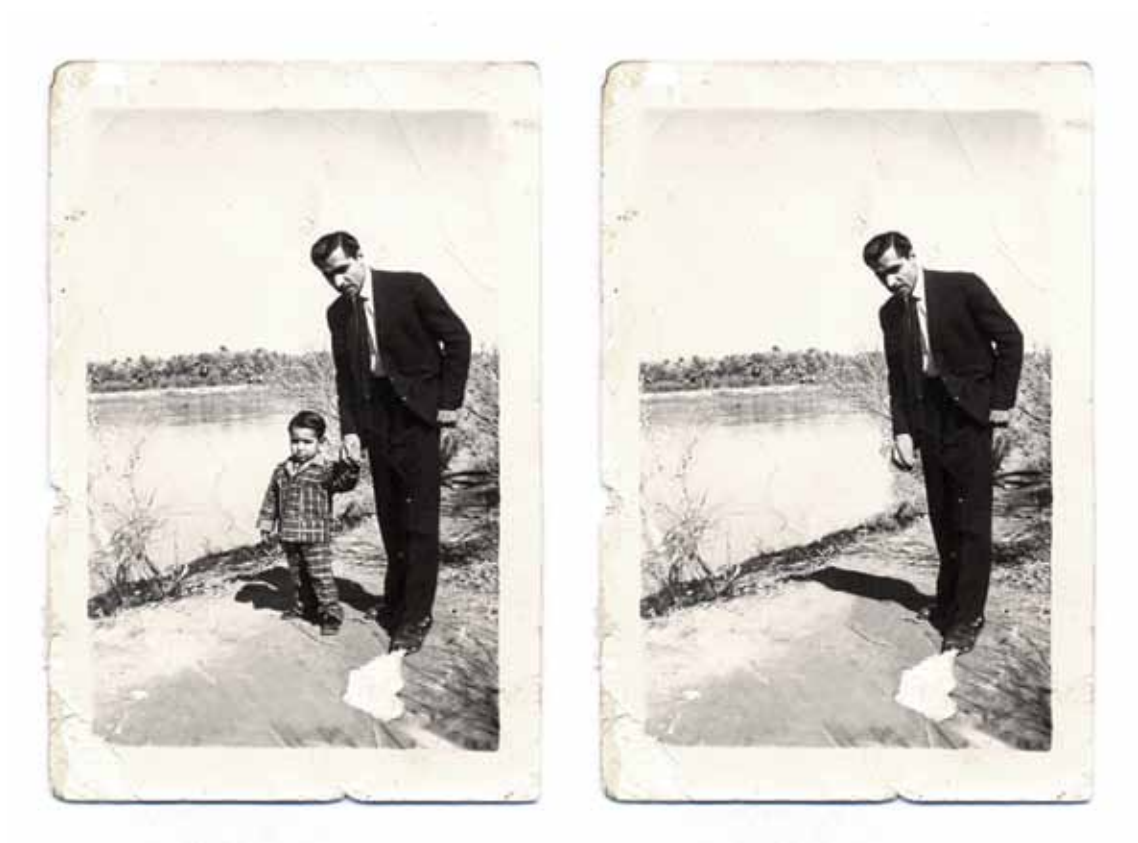
Nedim Kufi, Absence (2010), Photographic print on canvas, 180 x 240 cm (180 x 120 cm each), Barjeel Art Foundation