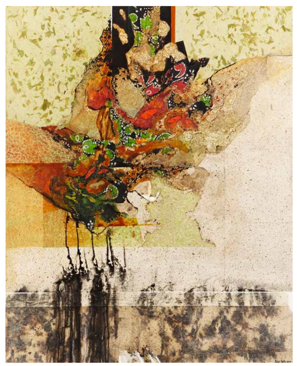
Delair Shaker, Wings of Hope (2010), mixed media on canvas, 152 x 122 cm