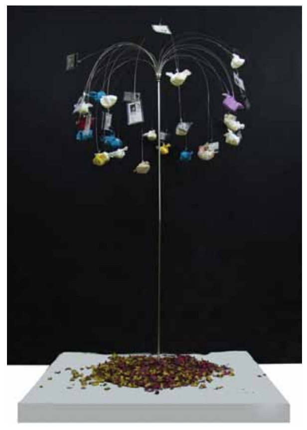
Ghassan Ghaib, The Tree of Memories (2010), Nickel with mixed media, 165 x 80 cm.

Tigris 'from a space of beautiful memories to an arena stained with sectarian conflict and policy.' Yahya, now settled in Houston, graduated from the Academy of Fine Arts with a degree in painting in 1987. Having grown up in Baghdad, he recalls: