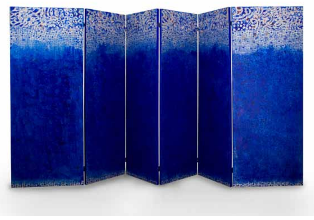
Himat Ali, The Sea (20052008-), mixed media, 200 x 400 cm

artists, started in the 1980s because of the Iran-Iraq War (198088-), accelerating during the Gulf War (199091-), and the situation resulting from the crippling economic sanctions imposed on the country. There were several artists, however, who