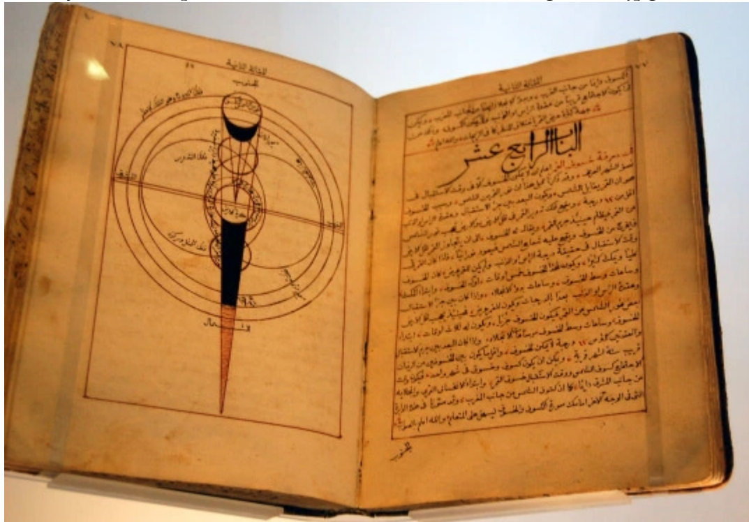
( https://donshevey.files.wordpress.com/2015/10/9-20-geometry-textbook.jpg )

Contemporary stuff ("Zikr" by Etel Adnan, below) mixed in with antiquity.