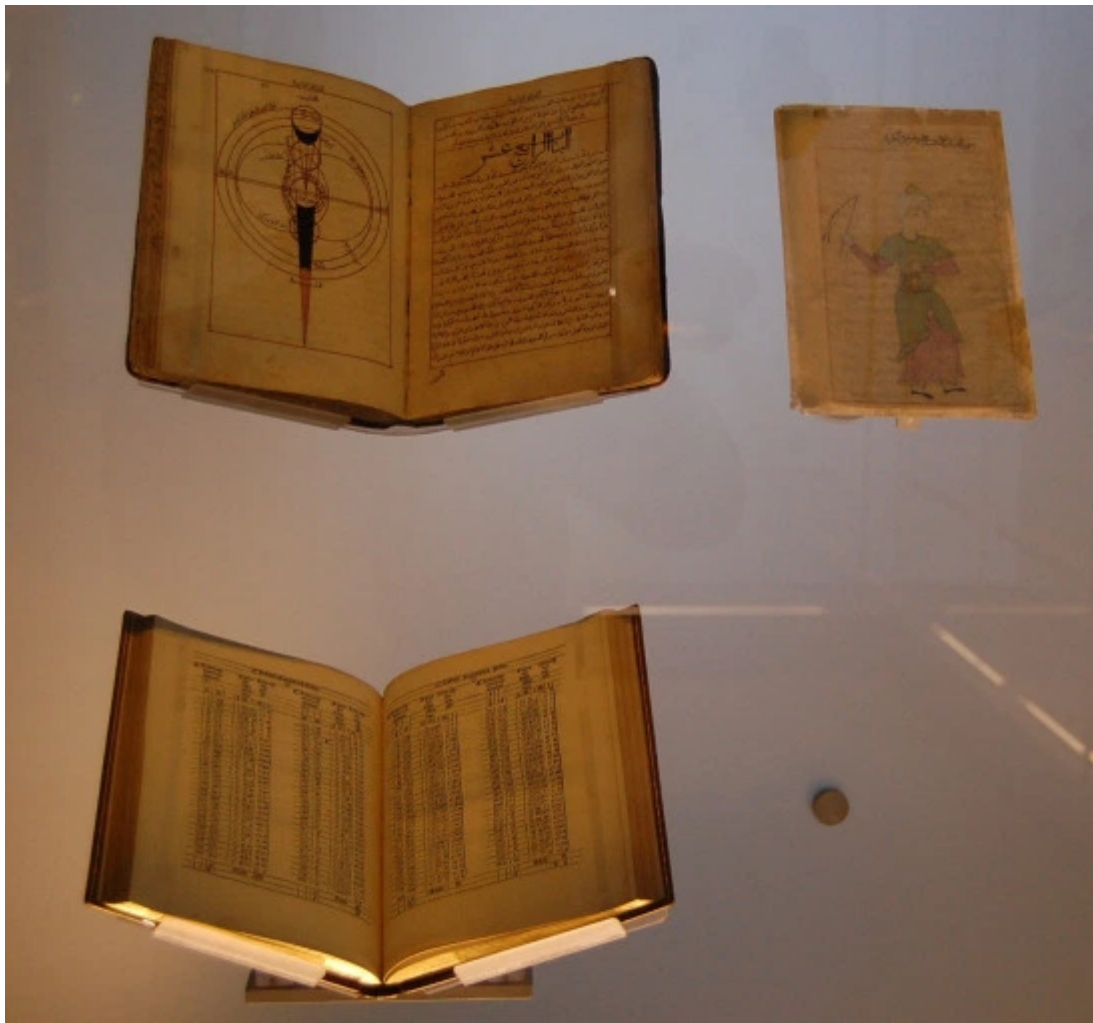
( https://donshevey.files.wordpress.com/2015/10/9-20-free-floating-books.jpg )