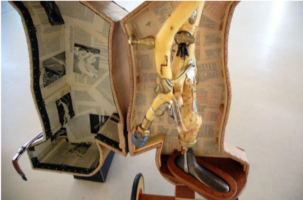
( https://donshevey.files.wordpress.com/2015/10/9-20-captain-ahab-detail.jpg )