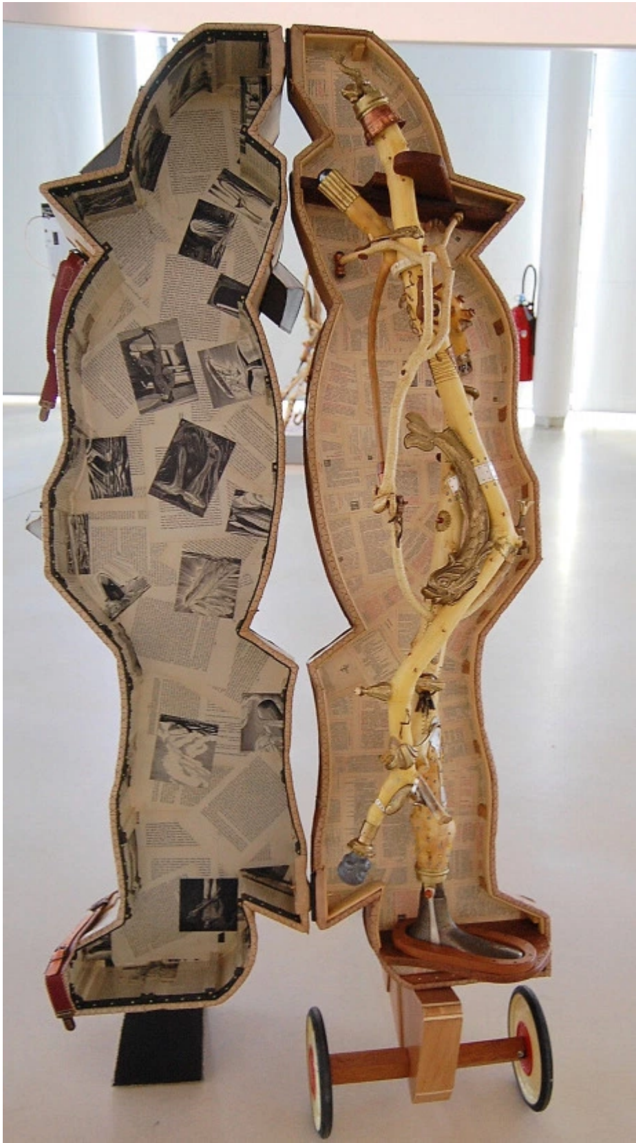
https://donshevey.files.wordpress.com/2015/10/9-20-captain-ahab-sculpture.jpg And the building is curious and quirky and geometric.