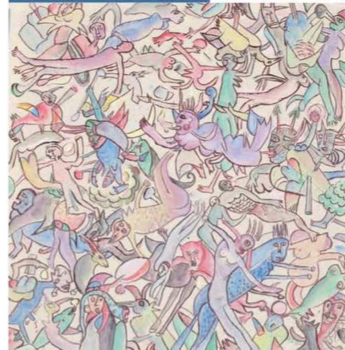
Sans titre • 2000 Techniques mixte sur papier - 37,5 x 37,2 cm