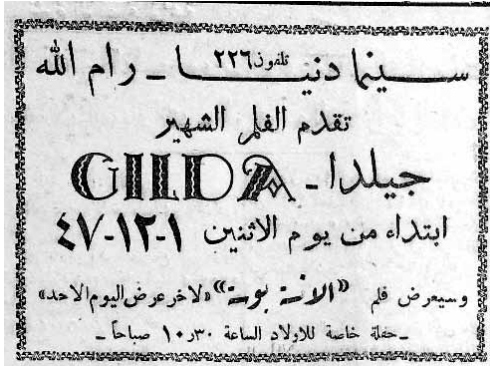
Advertisement that appeared in Falastin Newspaper on November 30, 1947.