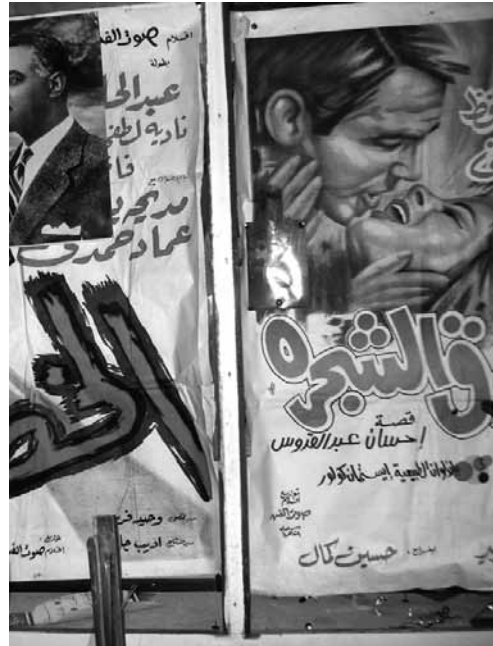
Posters at al-Waleed Cinema, picture taken in 2008 by the author.

“Once the Israeli military governor came to Dunia, and I asked him to put his machine gun in the offices if he want to attend the film. When he understood that I wasn’t kidding him, he threatened me saying I was not going to spend the night in Ramallah [meaning a possible night in prison], the same night I escaped to Jordan in the Silvana 3 truck”