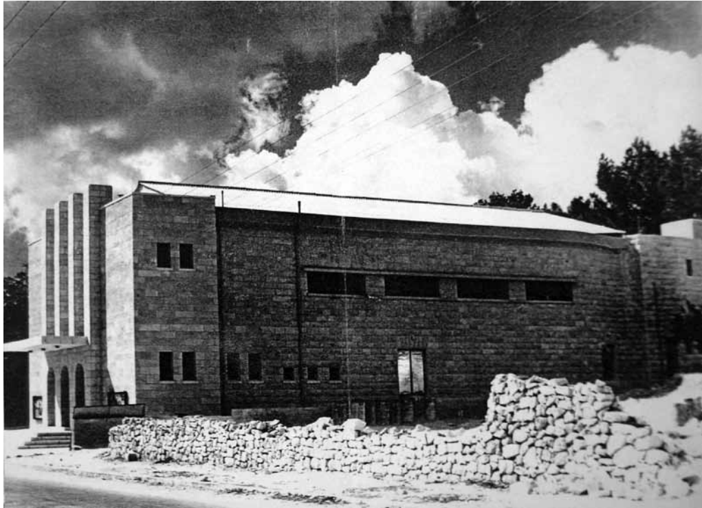
Dunia cinema 1947.

Palestine – were coming by buses or by their donkeys. The cinema seemed to have suspended its shows during the war of 1948; screenings were resumed about six months later.