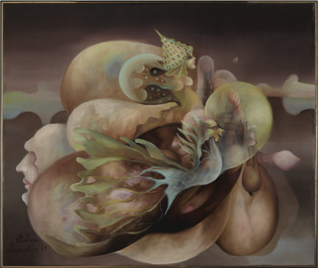
Juliana-Séraphim, 'Untitled', 1979, oil on canvas, 54 x 65 cm. Image courtesy Dalloul Collection. © Mansour Dib.