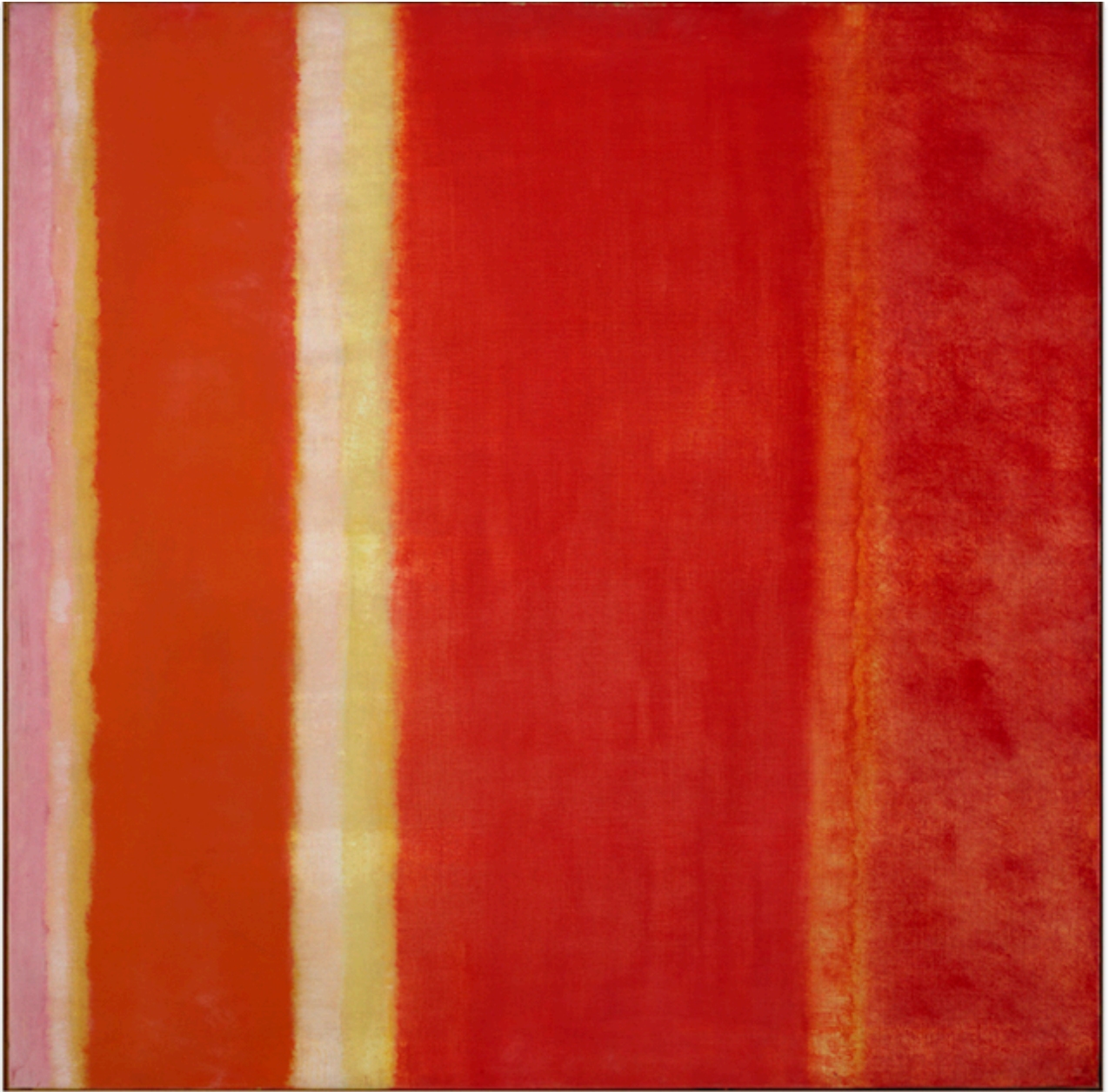
Helen Khal, 'Untitled', 1970, oil on canvas, 100 x 100 cm. Image courtesy the Dalloul Collection. © Mansour Dib.

Although Hadad is most well-known as a portrait artist of Bedouins and peasants, her landscapes are also prized for their keen attention to the nuanced details of nature and "oriental exoticism".