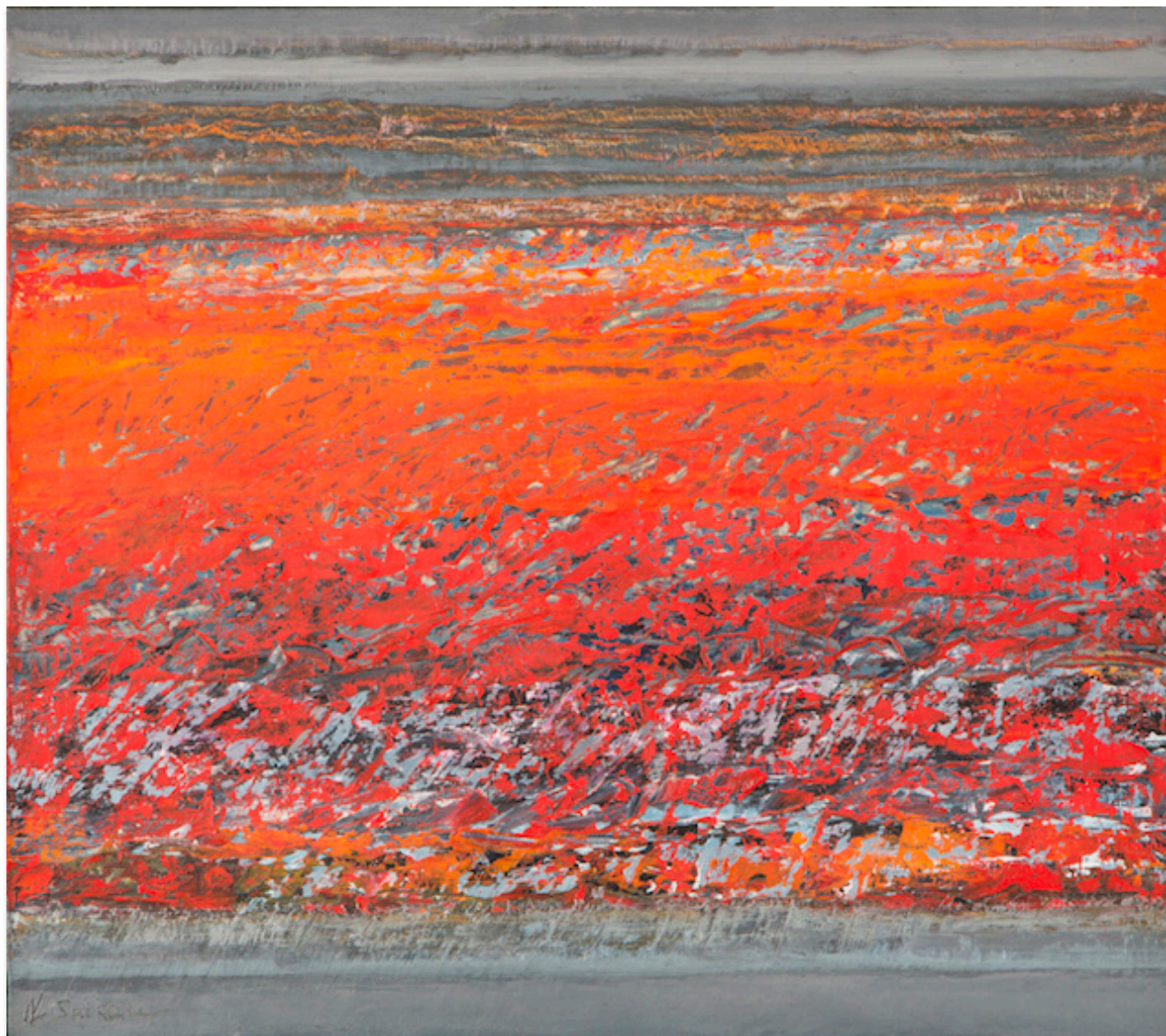
Nadia Saikali, 'Magma', 2008, oil on canvas, 80 x 90 cm. Image courtesy KA Modern and contemporary art. © Agop Kanledjian.

Manoukian's oeuvre examines the human condition, in particular, the effect of war upon Lebanese children, whom the artist worked with to create two books on this subject.