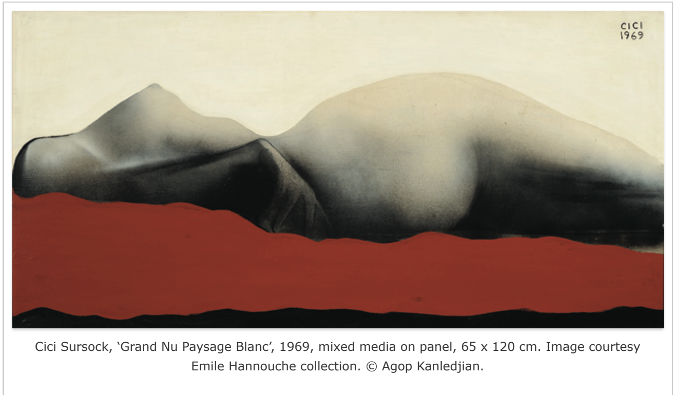
Cici Sursock, 'Grand Nu Paysage Blanc', 1969, mixed media on panel, 65 x 120 cm. Image courtesy Emile Hannouche collection. © Agop Kanledjian.