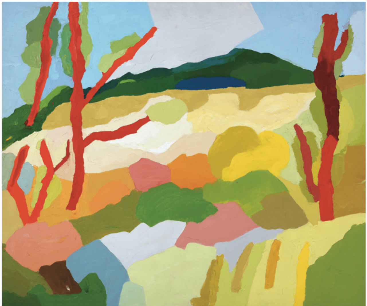
Etel Adnan, 'Landscape', 1990, oil on canvas, 77 x 91 cm. Image courtesy KA Modern and contemporary art. © Agop Kanledjian.

Achkar's abstract work is characterised by colour and movement but is largely fragmented. As the artist's biography on Galerie Janine Rubeiz website states, her paintings are "a lesson in counter intuition, without a defined framework of reference".