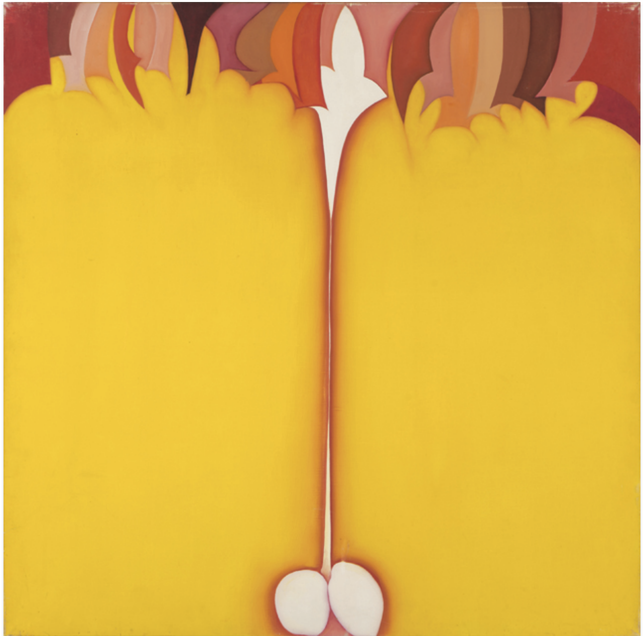
Huguette Caland, 'Bribes', 1979, acrylic on canvas, 80 x 80 cm. Image courtesy KA Modern and contemporary art. © Agop Kanledjian.

Ammoun's artwork often displays a combination of these two paradigms, with a nod to French avant-garde culture.