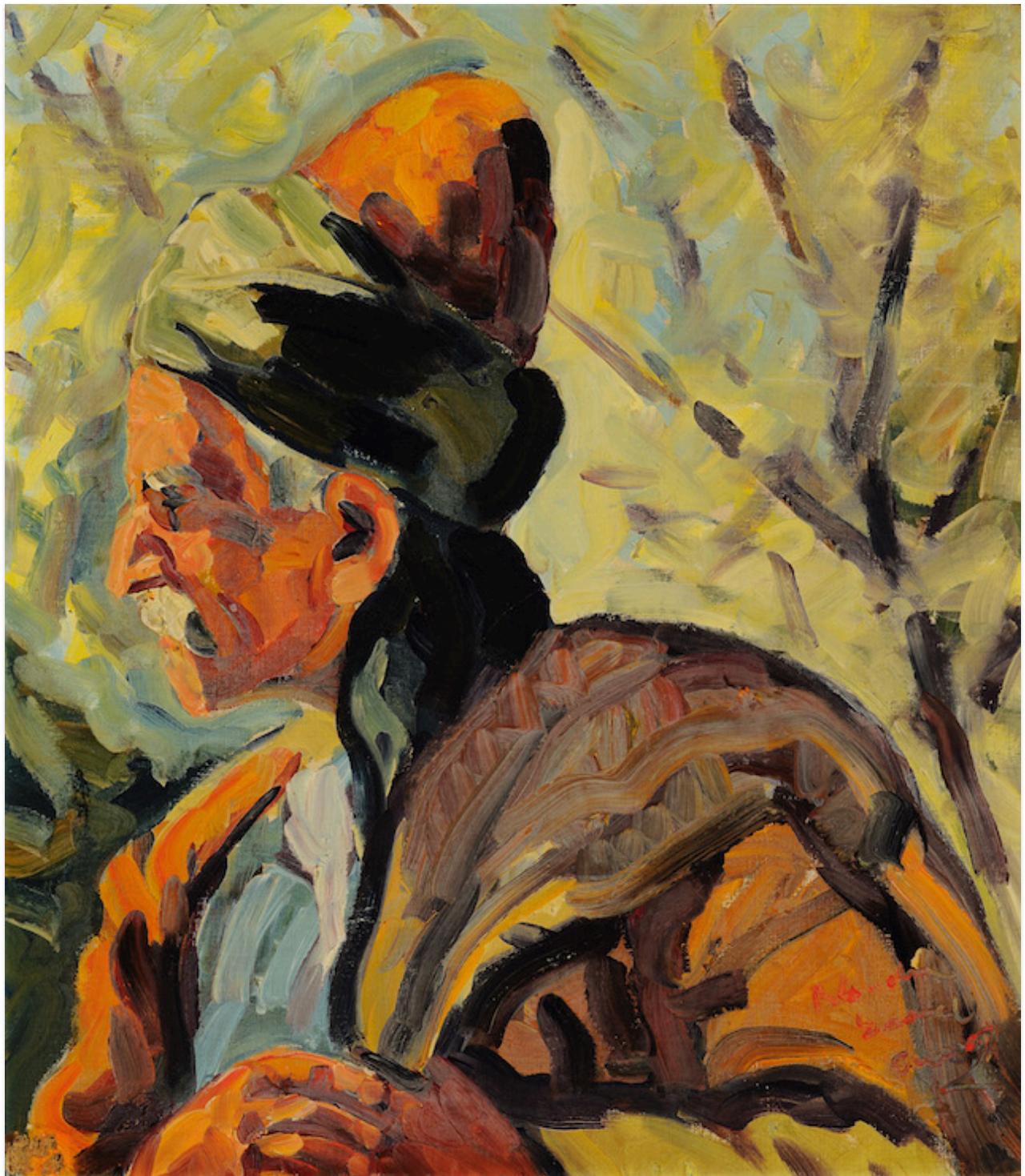
Blanche Lohéac Ammoun, 'Paysan Libanais', 1950, oil on canvas, 57 x 50 cm. Image courtesy Collection Emile Hannouche. © Agop Kanledjian.

the international art world. Hans Ulrich Obrist , the co-director of Serpentine Galleries , has called Adnan "one of the most influential artists of the 21st century."