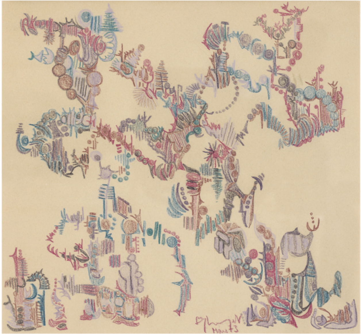
Laure Ghorayeb, 'Untitled', 1973, crayons on paper, 20 x 22 cm. Image courtesy the artist. © Agop Kanledjian.