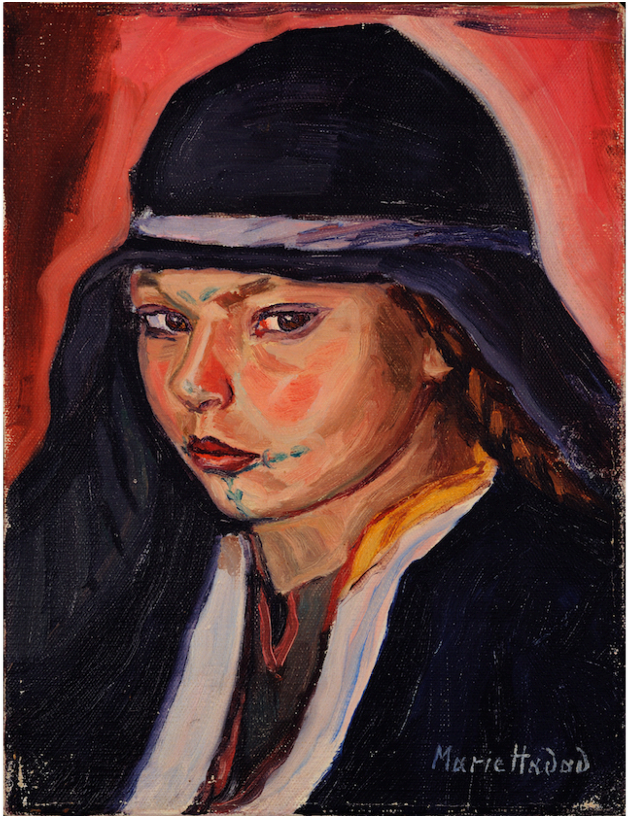
Marie Hadad, 'Petite Bédouine', 1940, oil on canvas, 37.5 x 27.5 cm. Image courtesy Michèle de Freige Collection. © Agop Kanledjian.