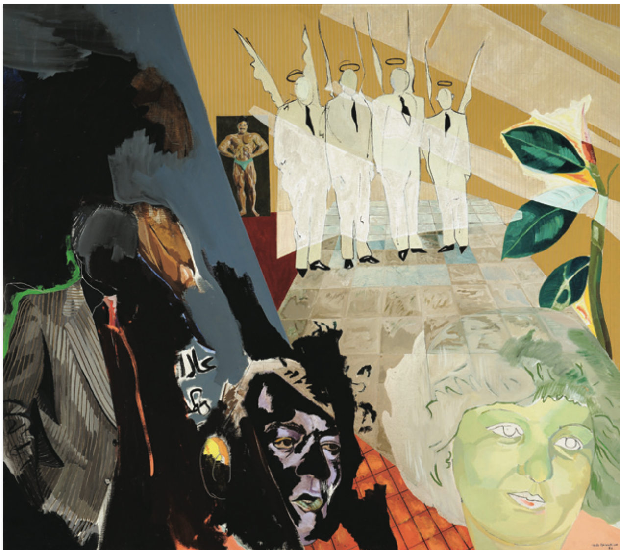
Seta Manoukian, 'The Angels', 1986, mixed medias on canvas, 150 x 170.

Khal, also known as Helen Karam, approaches art through the female condition, and her work is largely autobiographical in nature. The artist does not title her individual works but prefers to let the audience decide for themselves.