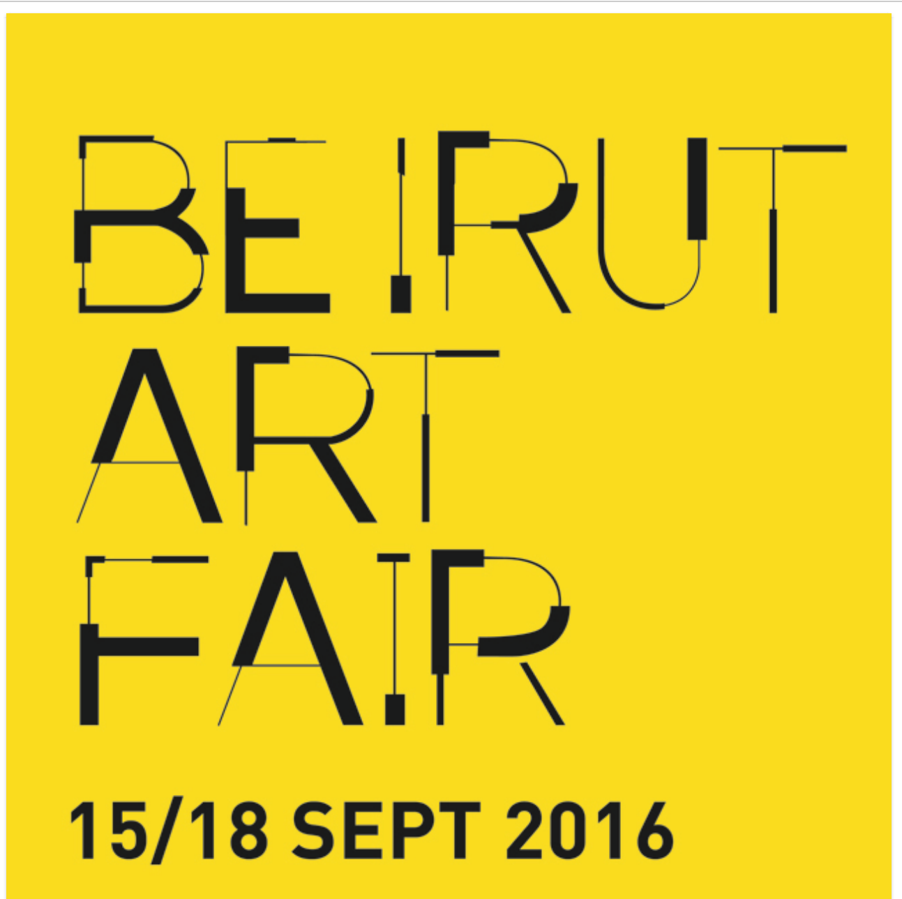
Beirut Art Fair 2016 logo.

Since 2010, the Beirut Art Fair has been introducing visual artists from the ME.NA.SA (Middle East, North Africa, South Asia) region to curators, collectors and institutions. The fair continues to thrive and gain both local and international support, with the event welcoming some 21,000 visitors and exhibiting 1,500 works in 2015.