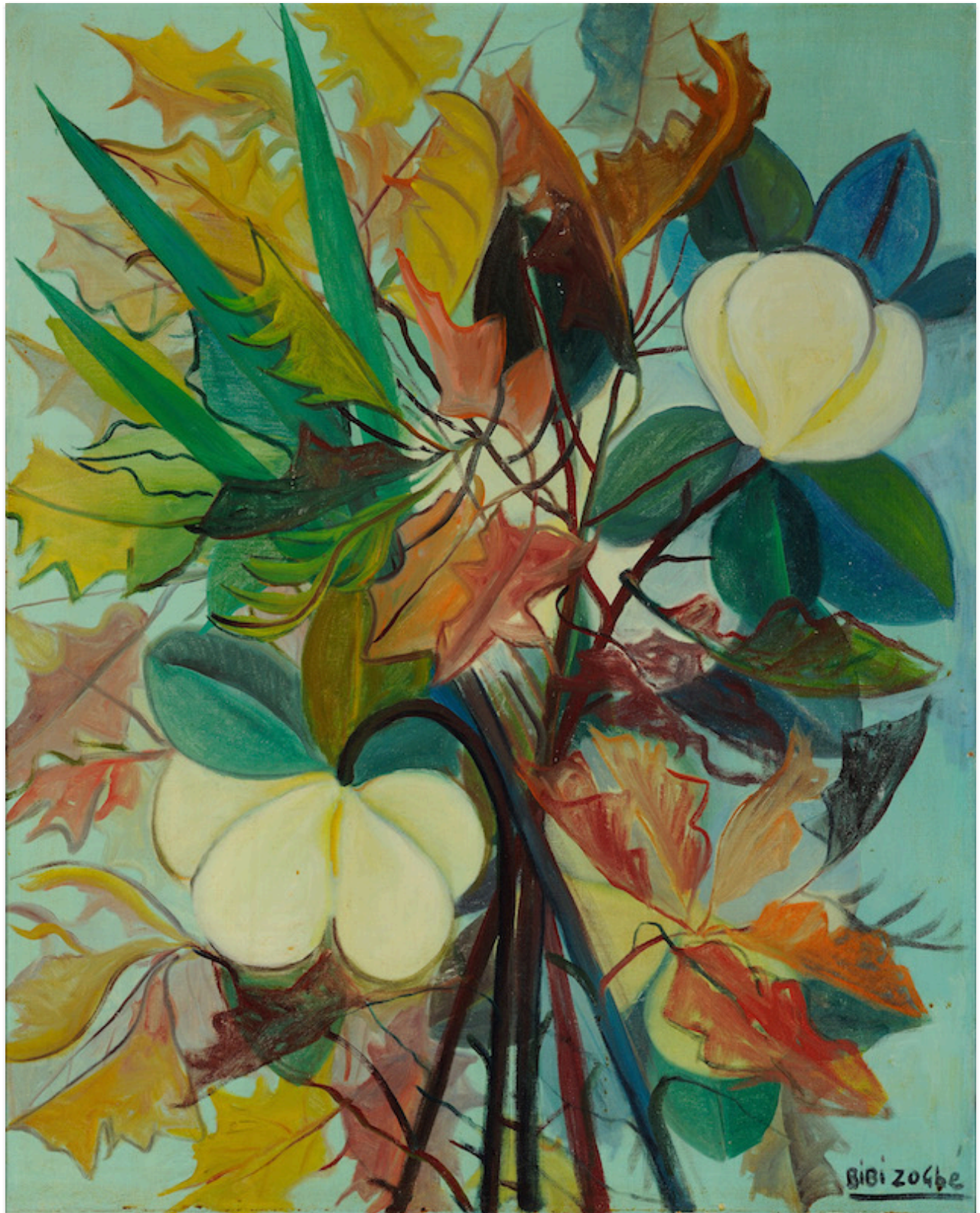
Bibi Zogbé, 'Fall', oil on canvas, 84 x 60 cm. Image courtesy Collection Emile Hannouche. © Agop Kanledjian.