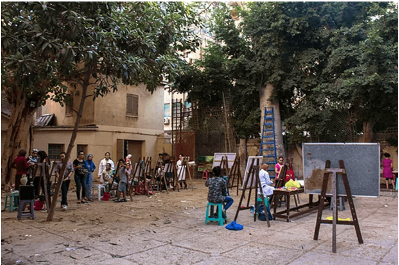
Children painting in the garden

Because Wahba was chairperson of the board and an artist himself, most of the atelier's resources and activities focused on visual arts. By the time Wahba left the atelier in 1995, the number of participants studying pottery, sculpture and painting had grown to more than 400 people.