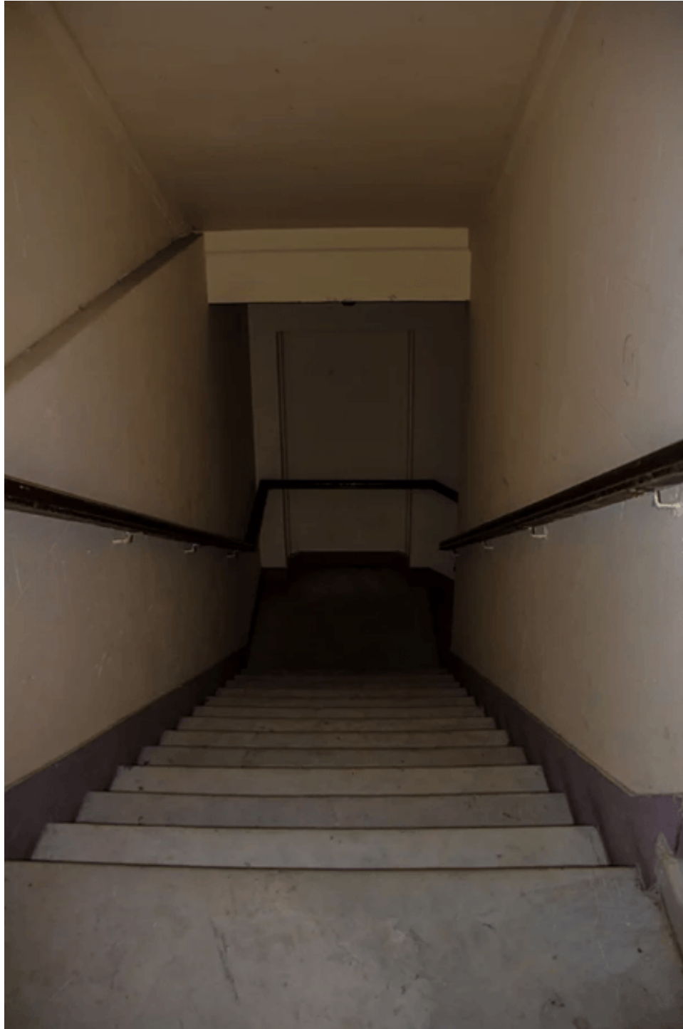
The stairs leading to the basement where artists worked