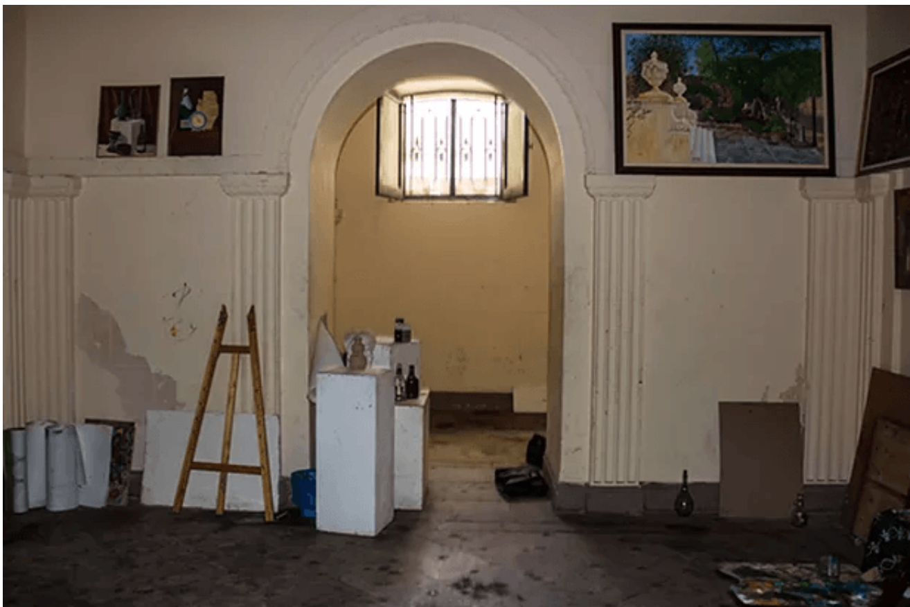
Interior view of the atelier