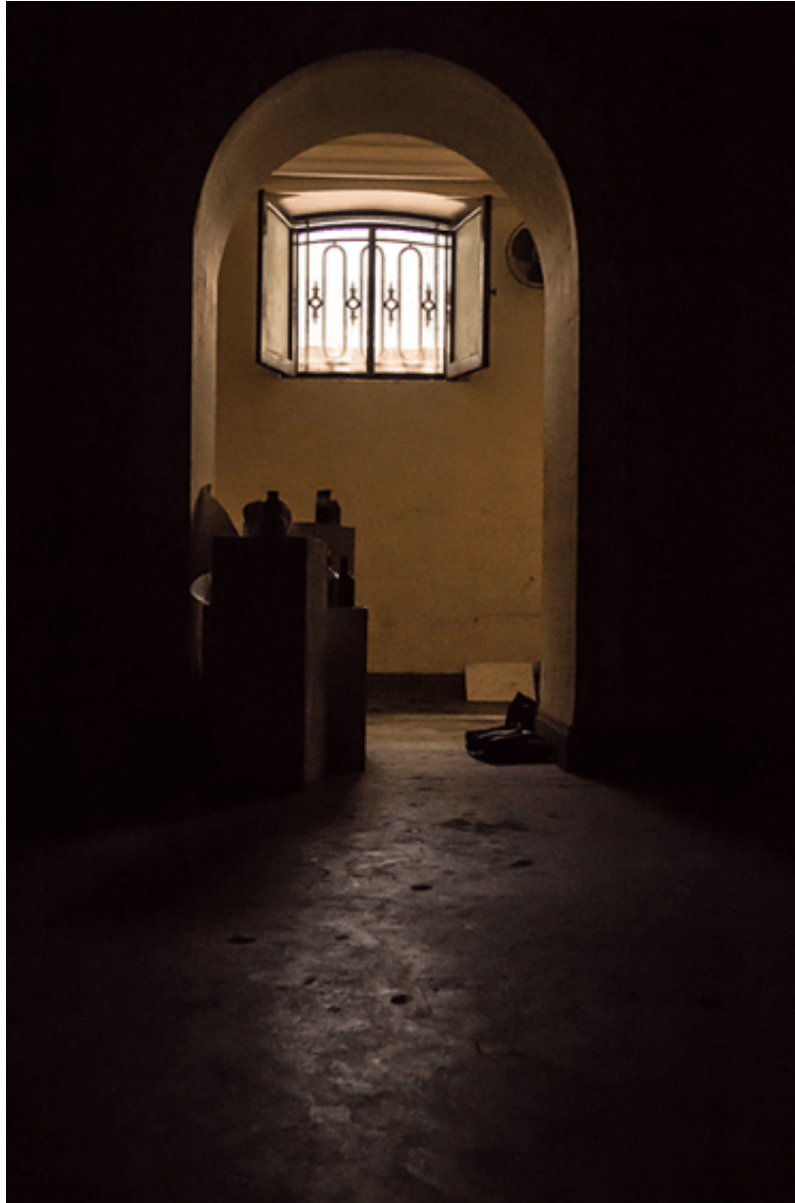
Interior view of the atelier