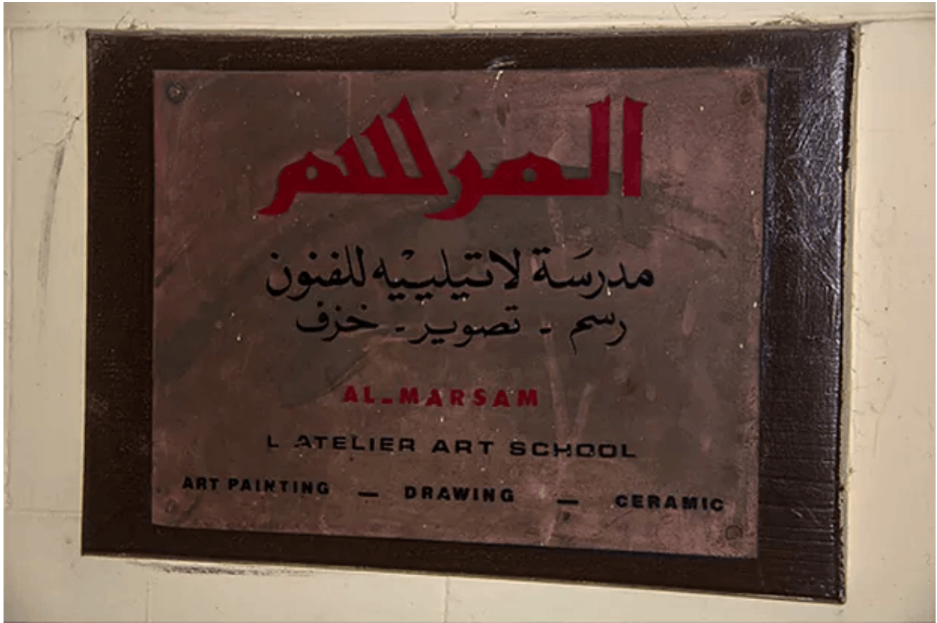
Sign at the door to the artists' studio