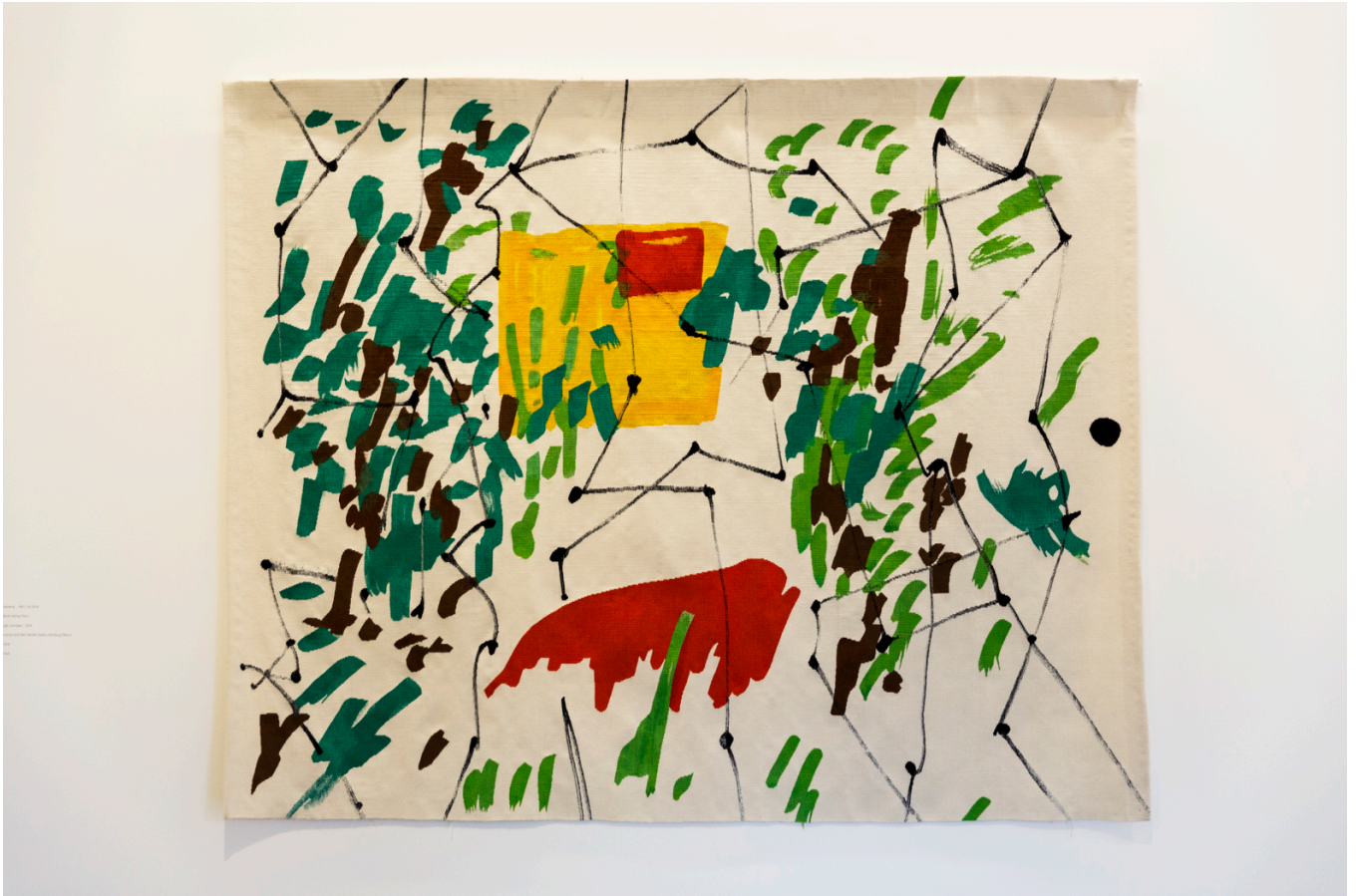
The Weight of the World (Installation view). Serpentine Sackler Gallery, London (2 June - 11 September 2016).