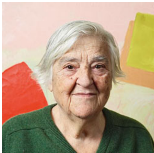
Etel Adnan. May 22, 2020 at 3:48pm