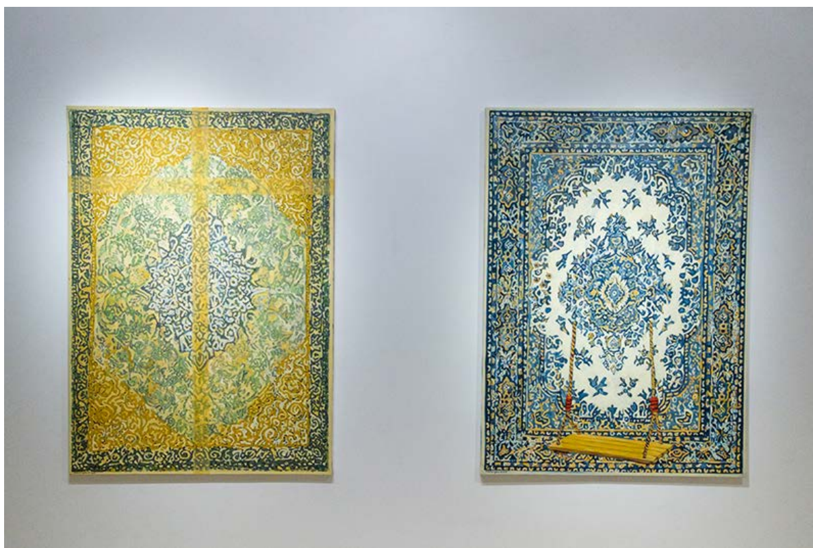
Two works from the 'Weaving and Cracks' collection.