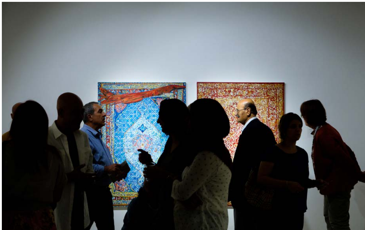
Viewers mingle in front of two pieces from the series 'weaving and cracks.'

Speaking about the role of the artists in Palestinian society, Agbaria said; "There is no doubt that what the Palestinian artist produces will be affected by what is happening around them, even if the painting is only of a bird or a rose."