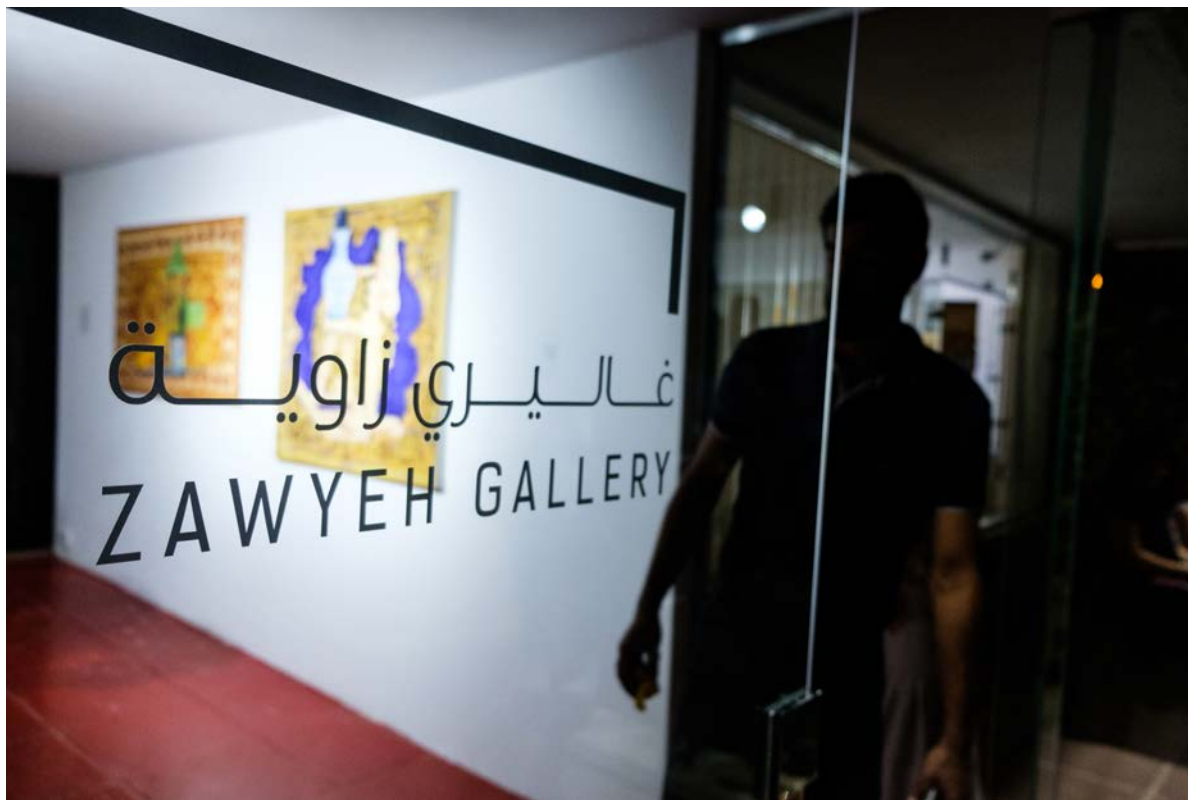
The front of Zawyeh Gallery.

Juxtaposed into the traditional Arabic carpet motifs are various symbols, signifying childhoods ruined by wars, and tools of killing and destruction, which have become part of the topography of the Arab world.