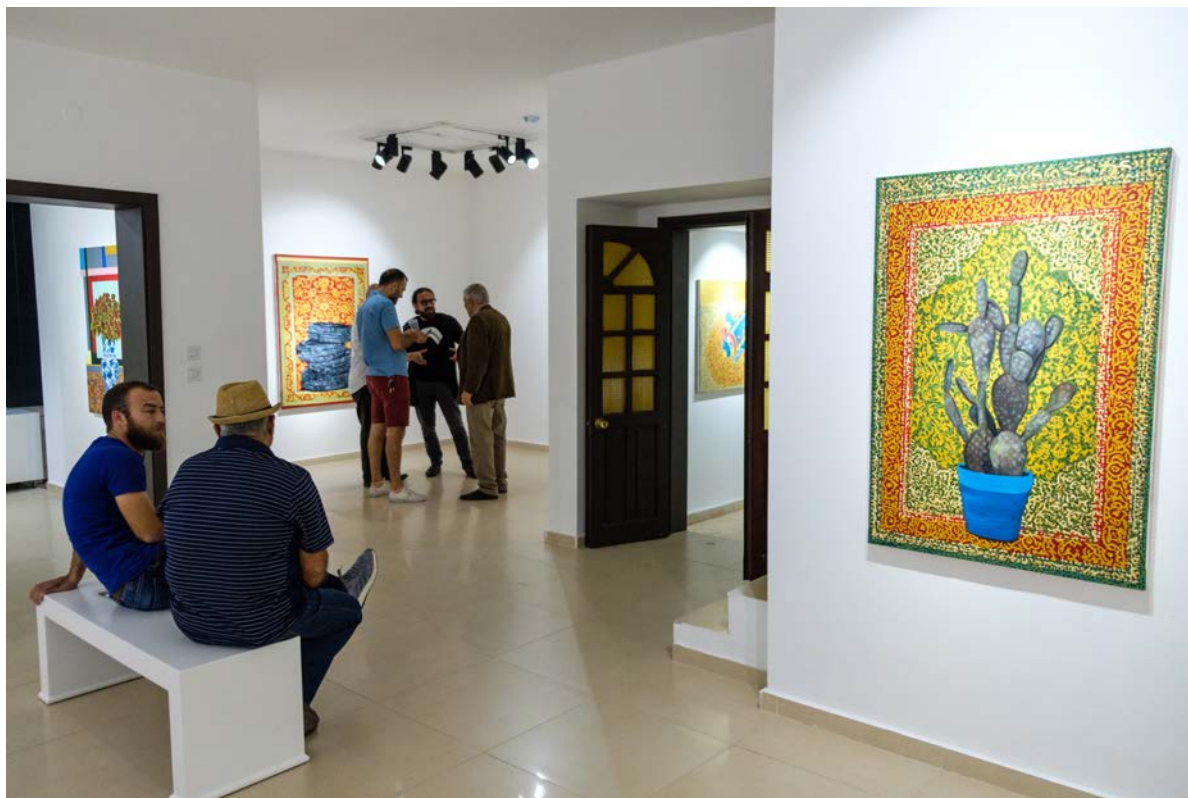
Fouad Agbaria's 'Weaving and Cracks' exhibit at Zahyeh Gallery.

With many commentators predicting big wins for the settler movement in