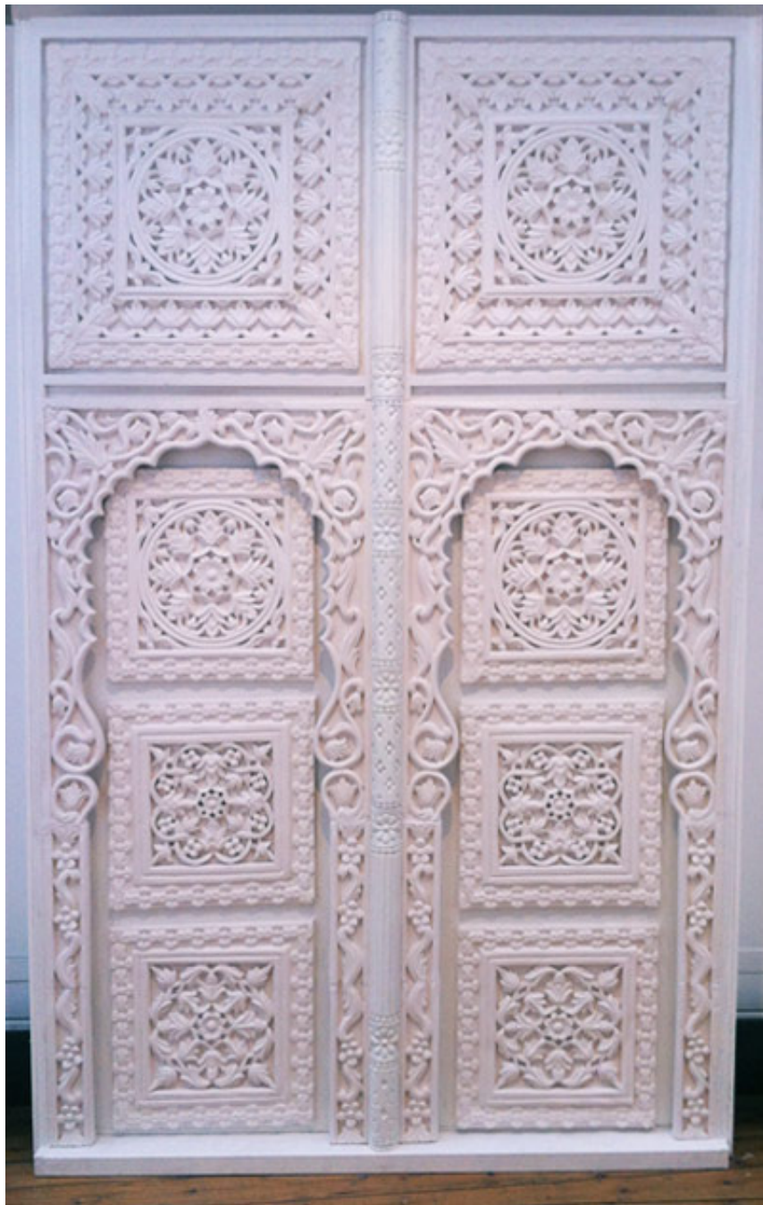
Plaster replica Hijazi doors by Sara Al Abdali