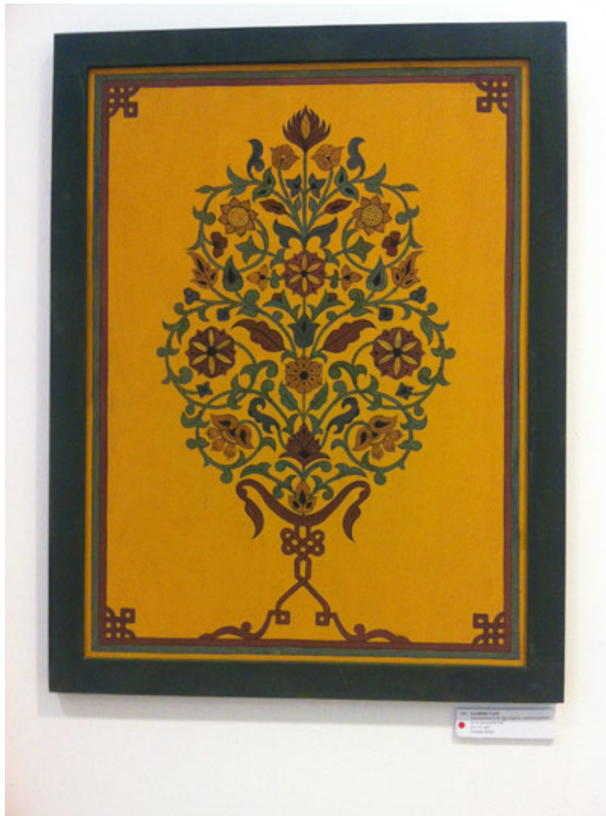
Painting by Natasha Mann using hand ground natural pigments with egg tempera and 24 carat gold leaf.