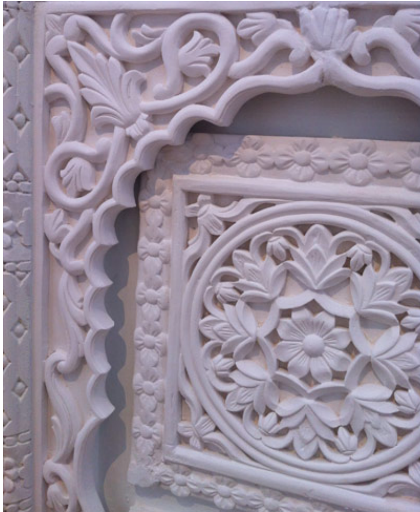
Detail of plaster replica Hijazi doors by Sara Al Abdali