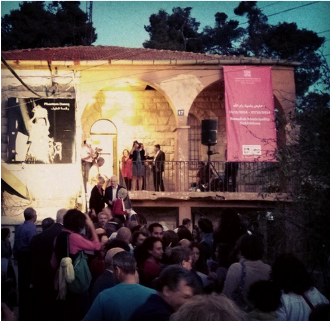
The opening on the 27th October 2014

The exhibition, part of the project Outside the Archive of Ramallah Municipality, continues until 15/11/2014 in Jaber House , 17 AIKuliyeh AIAhliyah St., 600 Ramallah