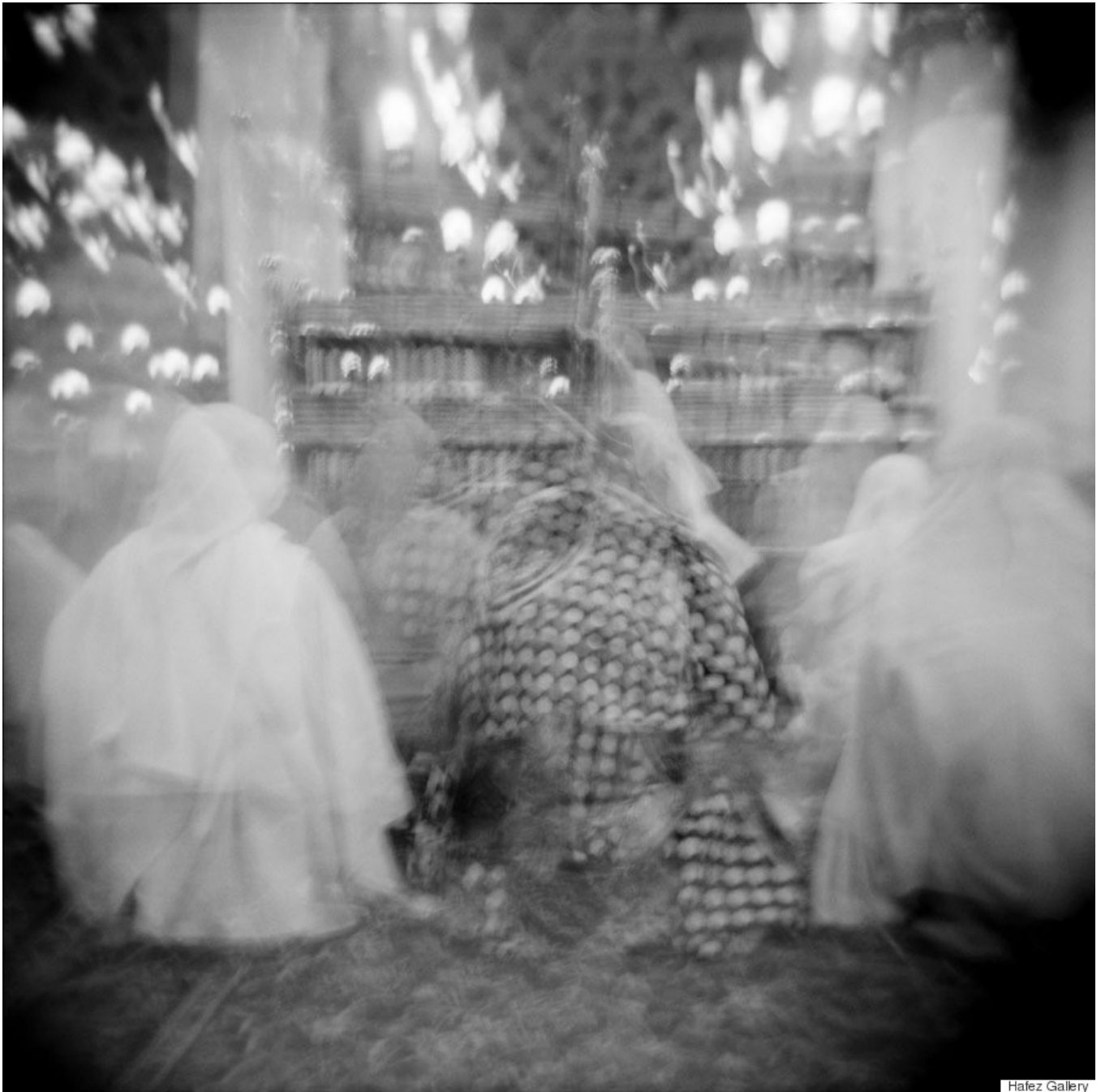
Nora Alissa, Untitled 9. 2012.

At Hafez Gallery , run by a local male artist, the recently closed show, "Anonymous: Was a Woman," looked at depictions of women by female artists. Saudi women tend not to go down in the history books. The works in "Anonymous" built a portrait of female life based on oral histories passed down for generations. The exhibit took its