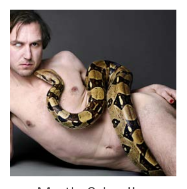
Martin Schoeller 20 Jun — 29 Aug 2020 at the Camera Work in Berlin, Germany