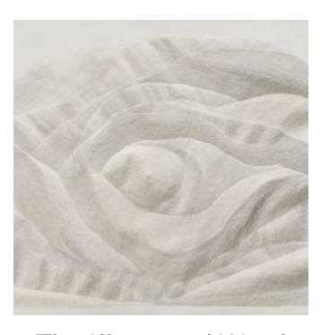
The Illustrated Word 12 — 19 Mar 2020 at the Chambers Fine Art in New York, United States