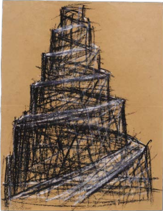
Walid Siti, Untitled drawing , charcoal on paper, 2001. Lent by the artist.