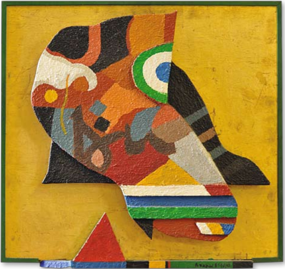
Dia al-Azzawi, The Mask of Gilgamesh , mixed media on wood, 1985. Private Collection.