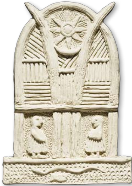
Faisel Laibi Sahi, Noah's Ark , 2003