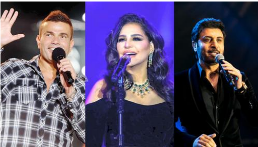
Saudi to host first post-Covid concerts to celebrate 90th National Day