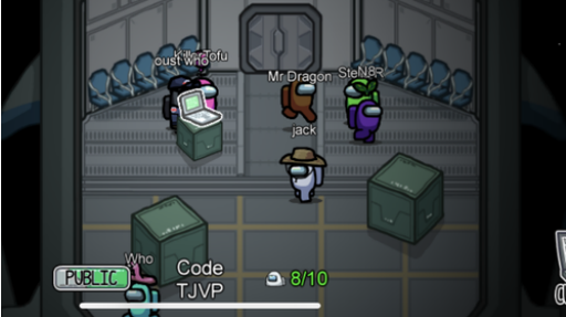
'Among Us': the online survival game that's all about deceit