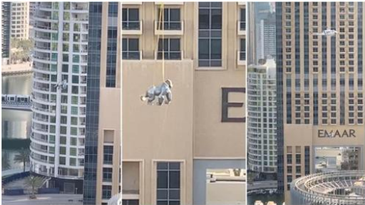
Giant gorilla and tiger sculptures fly through Dubai Marina by helicopter