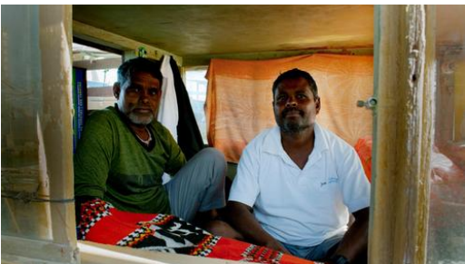
Memories of Mina Zayed: Abu Dhabi fishermen bid farewell to life as they knew it