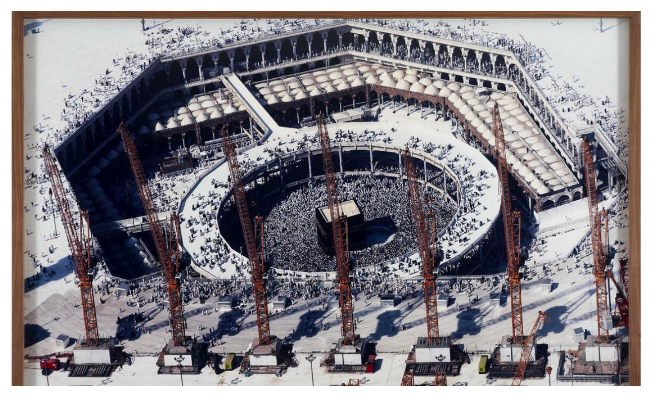
Ahmed Mater, Nature Morte, 2012, Laser chrome print on Kodak real photo paper, 124x177.5 cm, Edition 3/5, Courtesy of Ramzi and Saeda Dalloul Art Foundation

The beating heart of the Beirut Art Fair this year is an exhibition that is at once tragic and desolate, inspiring and uplifting. Ourouba: The Eye of Lebanon , curated by Rose Issa, also a London-based writer, seeks to answer a complex question: what does it mean to be Arab today?