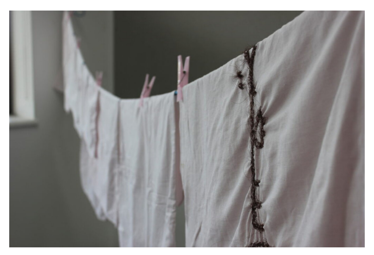
Kani Kamil's 'My Mom's Dream Secret'

Mountains. Featuring a range of media, including painting, video, photography, textile, sculpture and assembled constructions, the showcase aims to explore and reflect the trans-national reality of the global <u>Kurdish</u> <u>community</u>.