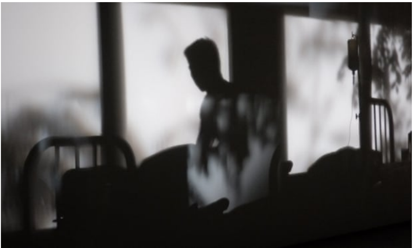
Room in gloom ... Invisibility (2016) by Apichatpong Weerasethakul.

What happened to rewarding artistic quality? Or is that now synonymous with expressing the correct worldview? Any prize shortlist that insists on a common intellectual approach by its chosen artists – political, religious, whatever – is clearly not being objective in its quest for excellence. Indeed it appears proud of that. I'd be happier if the judges shortlisted an artist whose politics repelled them. The provocative French writer and artist Michel Houellebecq would be one choice to liven up this tame event where every good artist apparently thinks the same as the curators do about everything.