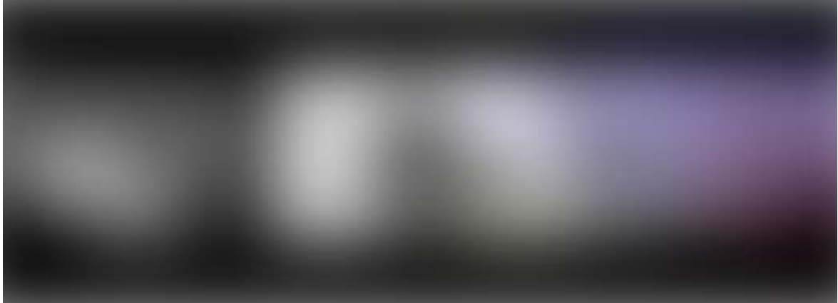
John Akomfrah. Still from “The Unfinished Conversation.” 2012. Three-channel video (color, sound), 45 min. The Museum of Modern Art, New York. The Contemporary Arts Council of the Museum of Modern Art, The Friends of Education of The Museum of Modern Art, and through the generosity of Bilge Ogut and Haro Cumbusyan.