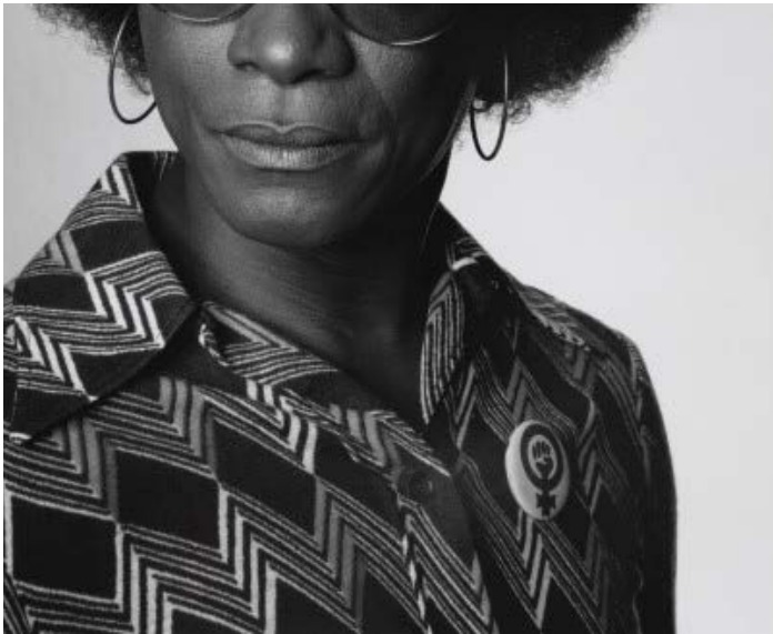
Fosso. Untitled, from the series African Spirits. 2008. Paper print. The Museum of Modern Art, New York. The Family of Man Fund. © 2017 Samuel Fosso

Islamic world and beyond, identified by accompanying labels that outline their original materials, time periods, and provenance. This purposeful rereading of official history undermines any romanticized or unified notion of Arab cultural identity, exploiting classical museological categories to call attention to their role in