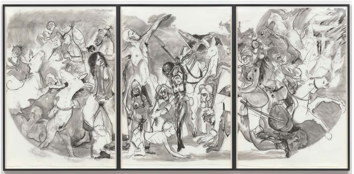
Kara Walker. "40 Acres of Mules." 2015. Charcoal on three sheets of paper. The Museum of Modern Art, New York. Acquired through the generosity of Candace King Weir, Agnes Gund, and Jerry I. Speyer and Katherine Farley. © 2017 Kara Walker

she reproduces the cover of radical activist Emma Goldman's 1914 journal Mother Earth , which portrays a neoclassical archetype of Patriotism defeating a figure of Liberty. Goldman had written about what she recognized as the struggle between these two ideals on the eve of World War I, in her 1911 article " Patriotism, a Menace to Liberty. " Her citation of patriotism as "the principle that will justify the training of wholesale murderers" and the image it inspired reads as a cautionary tale today, a moment when nationalist and protectionist ideologies are gaining traction worldwide.