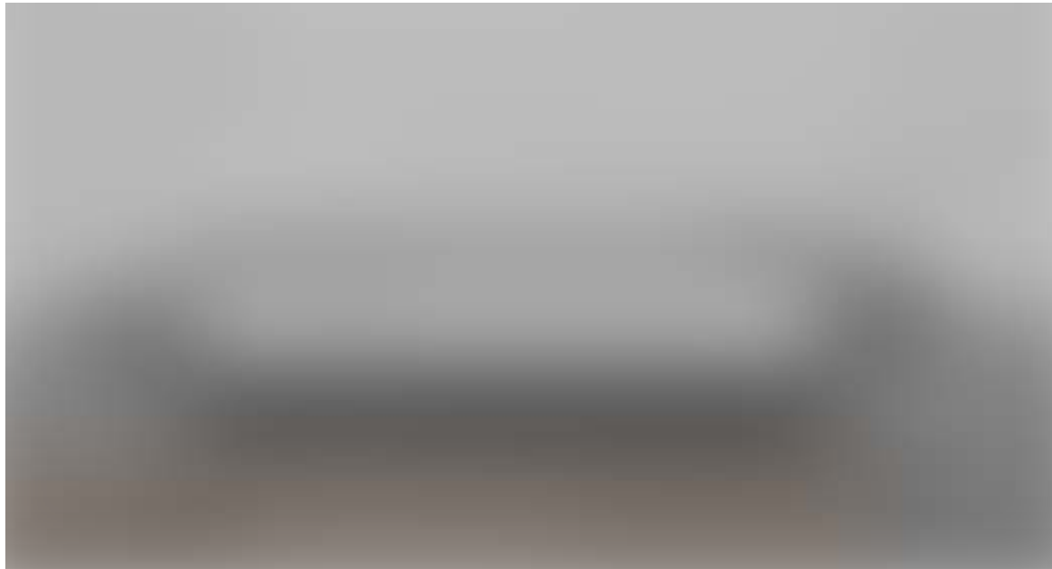
Iman Issa. "Heritage Studies #5." 2015. Aluminum and vinyl text. Fund for the Twenty-First Century. © Iman Issa