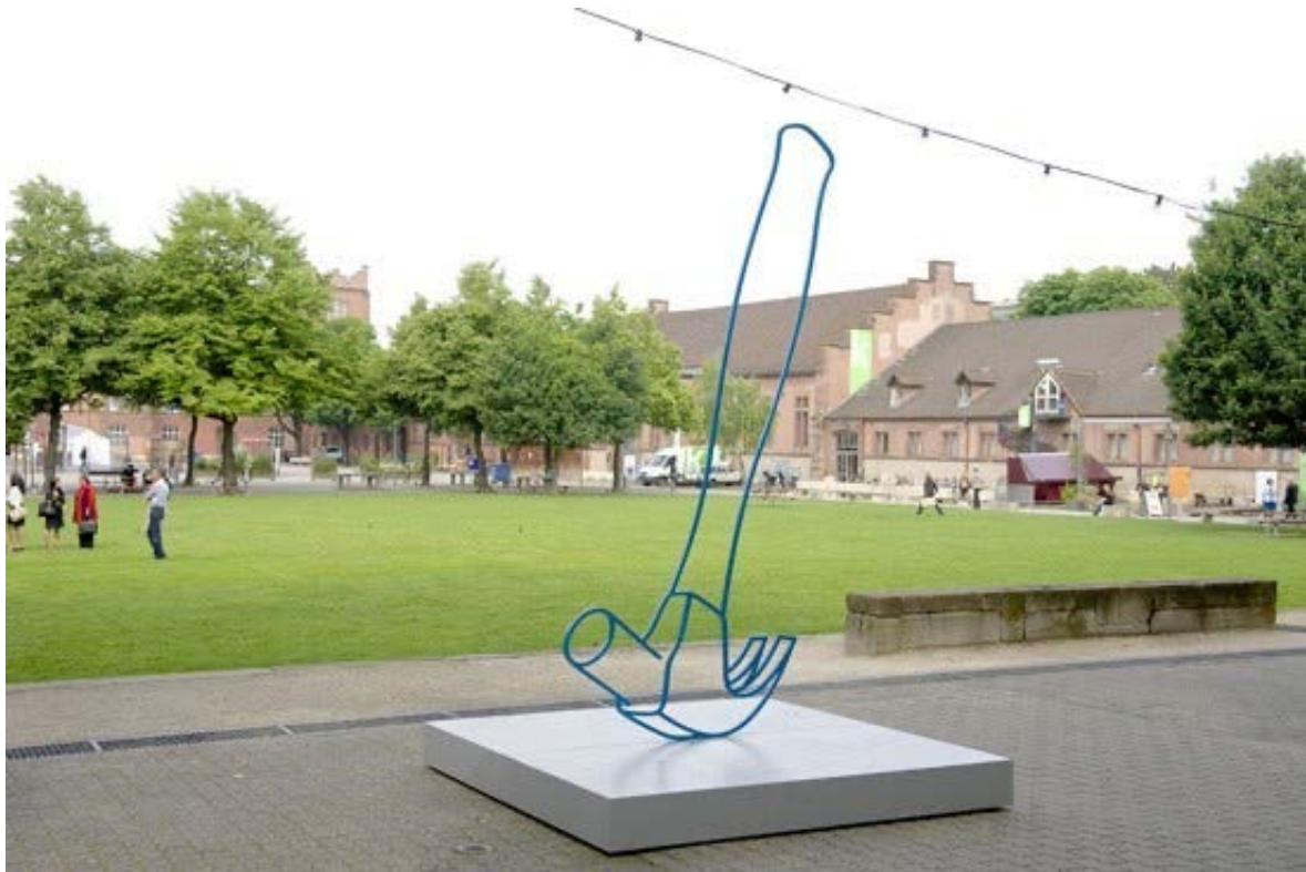
Art Basel 2013 | Parcours | Michael Craig-Martin | Hammer (blue)