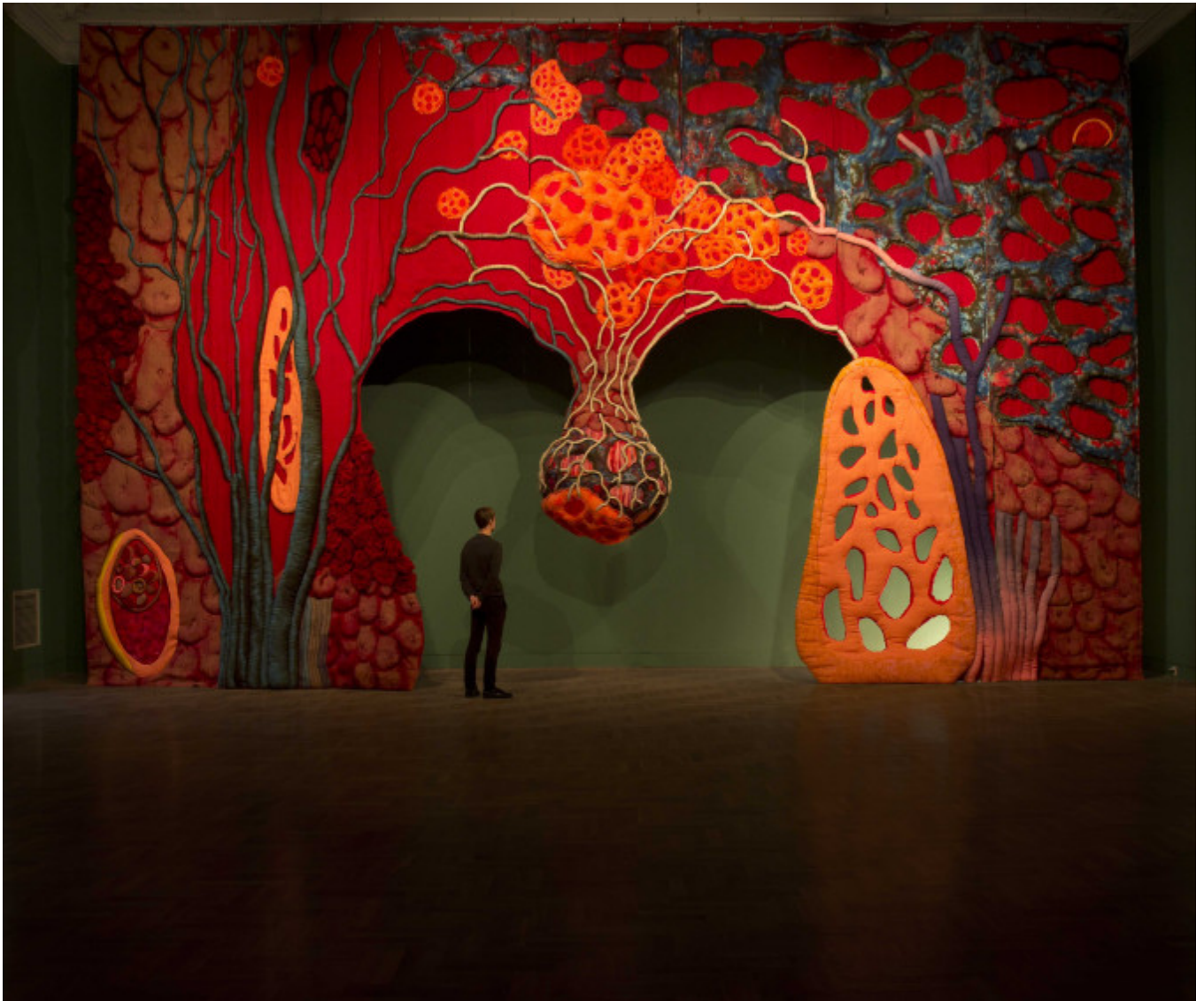
Piotr Uklanski's sculpture

Each summer, the art world descends on the small Swiss city notable for its museums, theaters, and, arguably the world's most prestigious art fair. Here are some highlights from 2013's program.