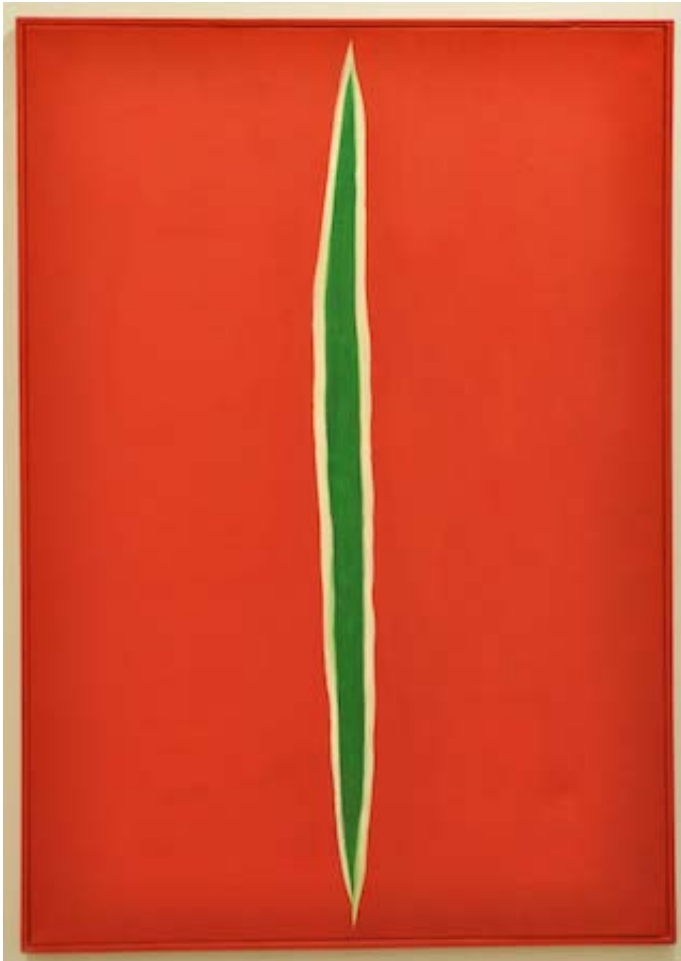
Huguette Caland, "Untitled" (1968), oil on canvas, 100 x 70cm, Galier Janine Rubeiz

Even today, the history of modern art may be a little more inclusive, with additions from Latin America and East Asia, but massive gaps remain. Modern art of the Arab and Islamic worlds is still largely absent from art history, except for the occasional sojourns by already enshrined Modernists, like Matisse in Algeria or Le Corbusier in Iraq. And while the history of modern art may have started later in Cairo or Beirut than Paris or New York, it is wrong to assume that it didn't — or doesn't — exist.