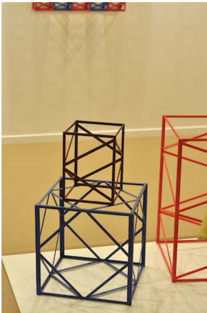
Works by Rasheed Araeen at Grosvenor Gallery

At Art Dubai Modern, most of the names weren't familiar to anyone except for a few scholars and dedicated collectors in the field. The early 1960s hard-edge abstractions of South Asian artist Anwar Jalal Shemza look fresh, and Lebanese artist Huguette Caland's more organic canvases feel deeply personal and introspective. Even if some of the work, like Indian artist M.F. Husain's bright palette, can look largely derivative of Western trends, there's still a sense of the work being rooted in local sensibilities and approached with a directness that make the work appealing. "I am like a folk painter," Husain once told the BBC. "Paint and move ahead."