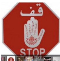
Shubbak -The First Contemporary Arab Festival in London