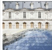
Louvre prepares to open its Art of Islam wing