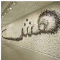
Mathaf: Arab Museum of Modern Art in Qatar - Exhibition of Cai Guo-Qiang