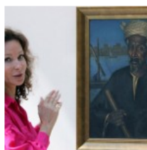
Christie's Middle East sales hopes to encourage new young buyers