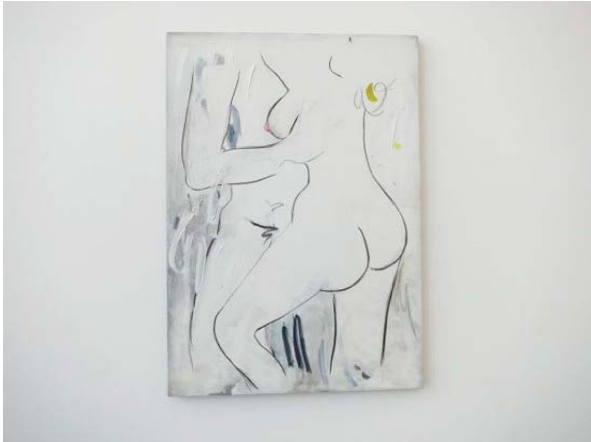
Laura Owens Untitled (2012)