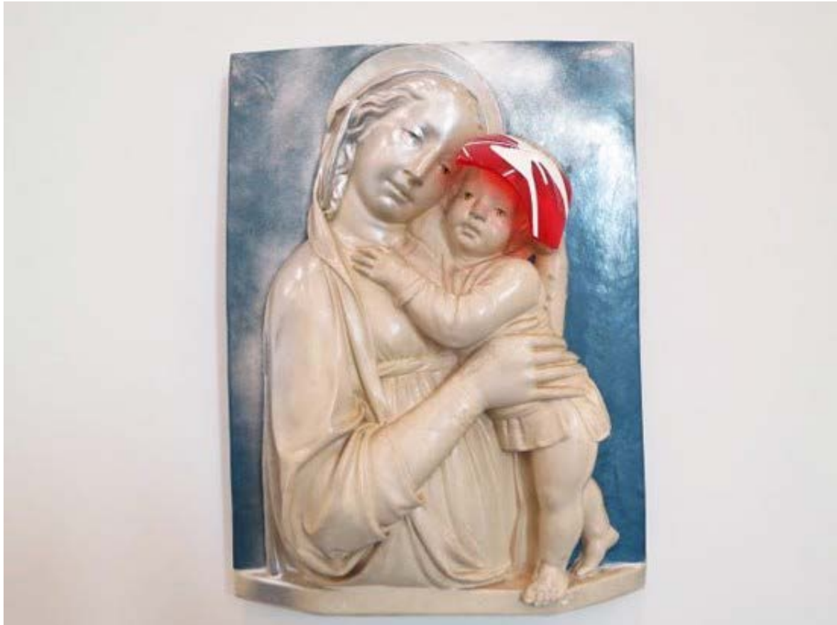
Isa Genzken Madonna mit Kind (Della Robbia) (2006)