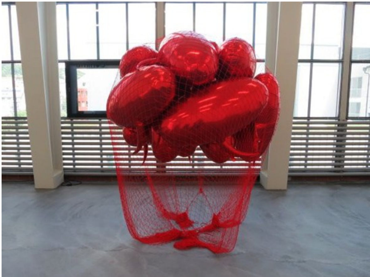
Philippe Parreno Untitled (2012)