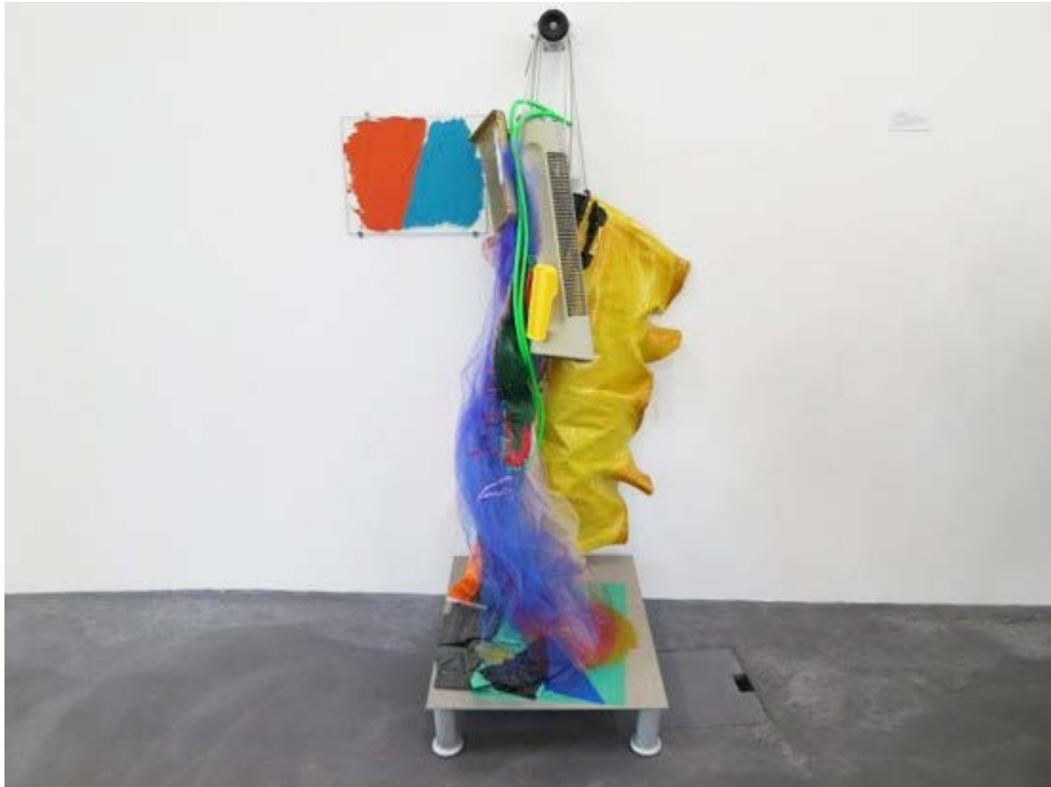
Jessica Stockholder Untitled (2006)