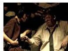
Ho Tzu Nyen