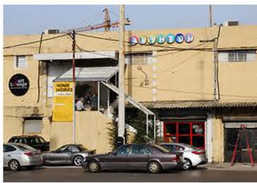
Artheum, venue of the exhibition