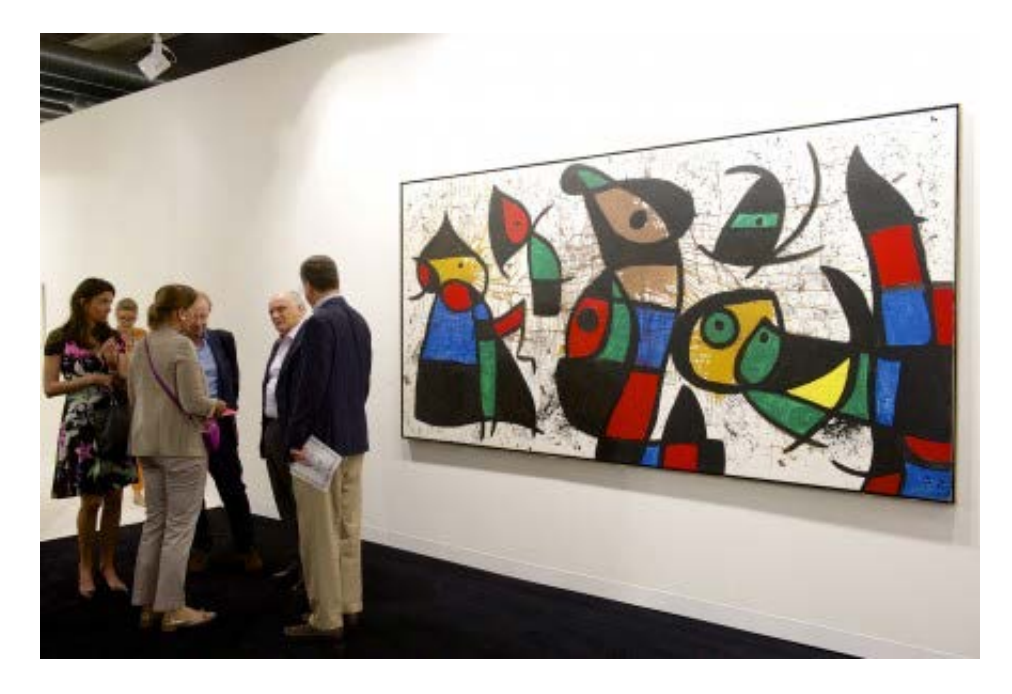
Nahmad at Art Basel 2013, (Installation View)