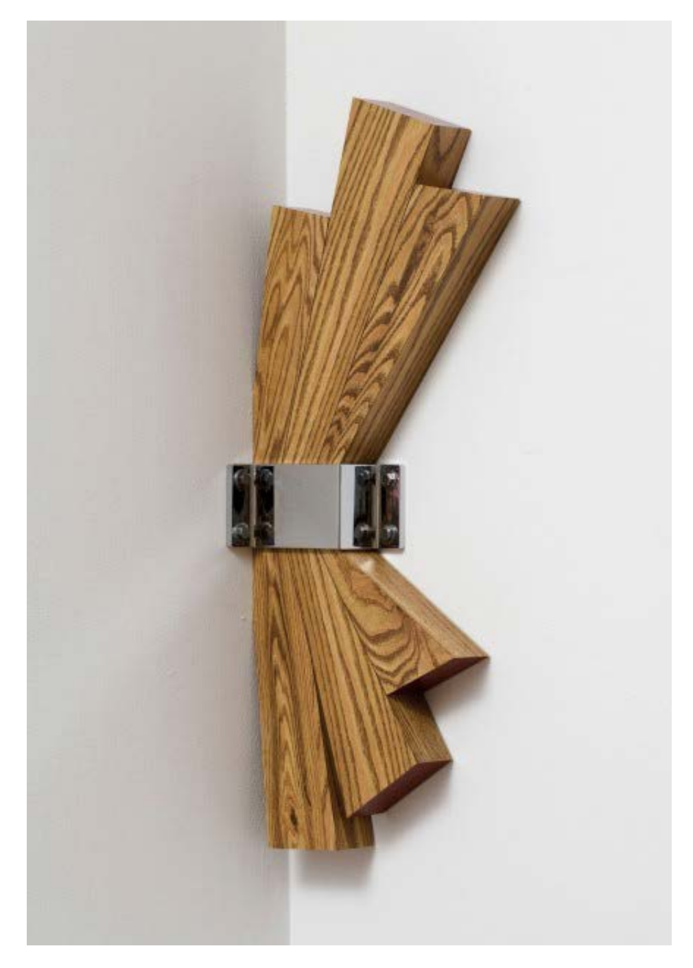
Richard Artschwager, Corner (1992), via Art Basel