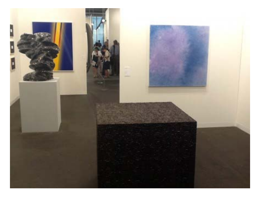
Art Basel 2013 (Installation View), via ArtBasel, Courtesy of Lisson Gallery