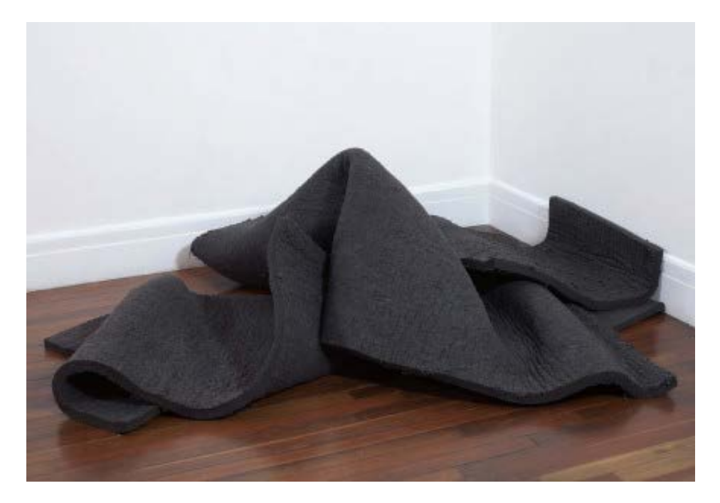
Robert Morris, Untitled (1968)