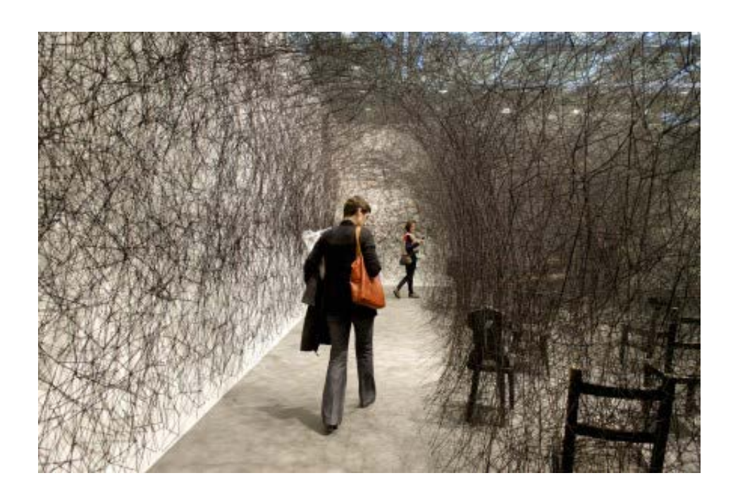
Chiharu Shiot, Templon at Art Basel 2013 , (Installation View)