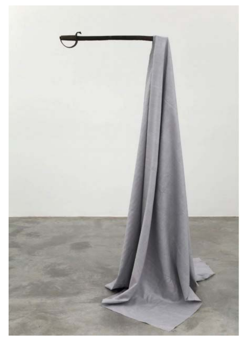
Geoffrey Farmer, Time Interrupted (2012)