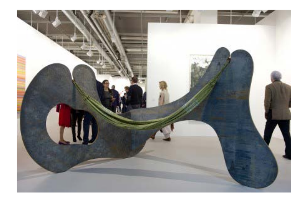
Hetzler Gallery at Art Basel 2013, (Installation View)

The Features sector exhibits curatorial projects of 24 galleries from 16 countries, running the gamut from solo presentations to thematic projects addressing questions of culture, history and artistic ethos. The Edition sector holds the works, prints and multiples produced through collaborations between leading publishers and renowned artists, and the Magazine sector welcomes international art publications to contribute their magazines to one collective booth. The Magazines and Statements sectors, as well as the talk's auditorium, will be relocated this year to the new extension of Hall 1, which was designed by Basel architects Herzog & de Meuron.