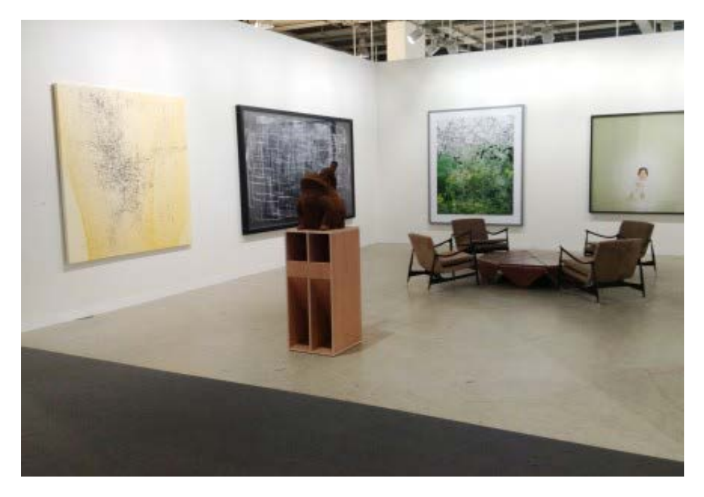
Art Basel 2013 (Installation View)