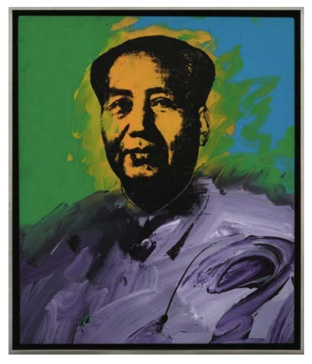
Andy Warhol, Mao (1973), via Art Basel