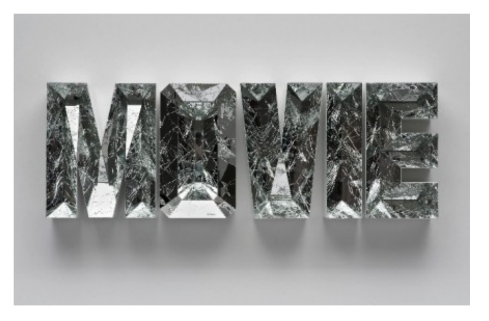
Doug Aitken, MOVE (2012), via Art Basel