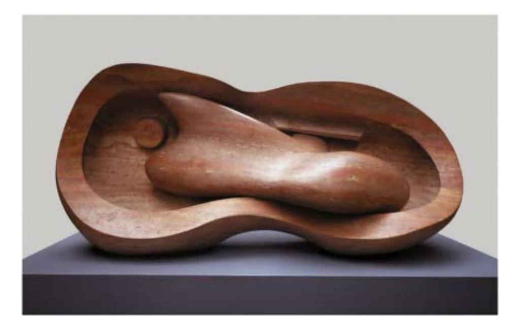
Henry Moore, Reclining Interior Oval (c. 1965-69), Marlborough Fine Art at Art Basel 2013, (Installation View)

In total, the works on sale add up to over $2 billion in value, with raised sales expectations since to the $1.1 billion of sales during May's contemporary auctions in New York. Among the most costly items, the Montreal-bases dealer Landau Fine Art presents the 1960 Rene Margritte surrealist canvas Un peu de l'ame des bandits priced at $12.5 million. Marlborough Fine Art, a London-based dealer, will exhibit a 7 feet wide Henry Moore red marble sculpture entitled Reclining Interior Oval with a price tag of approximately $10 million. Nevertheless, while the largest dealers are enjoying a monopoly on the art market, small dealers are suffering under a period of retrenchment, and will look to stand out in the yearly Basel crowds.