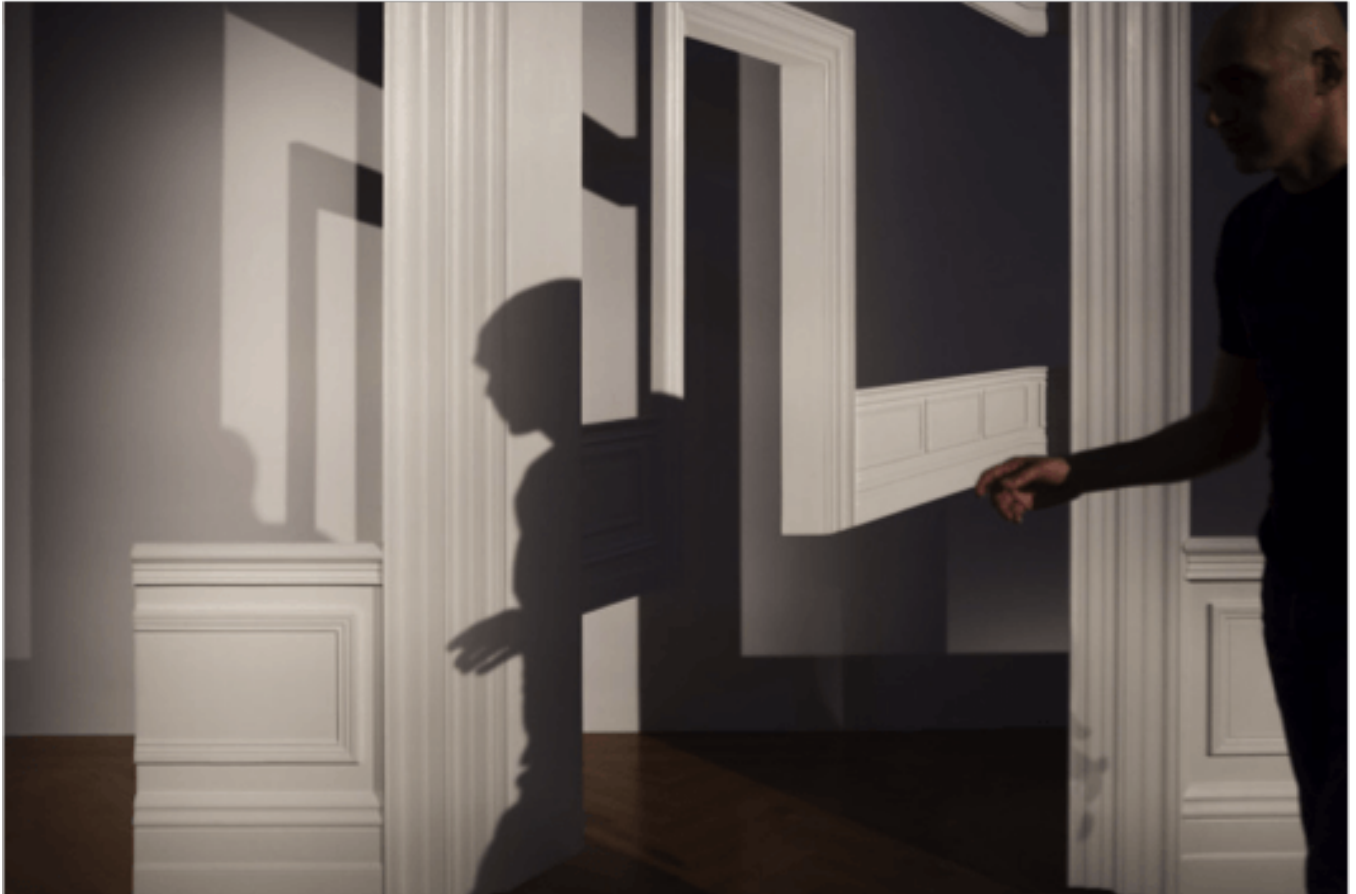
Views from outer to inner compartments, 2015