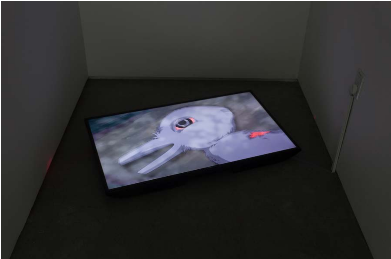
Full gallery of images, press release, video and link available after the jump.