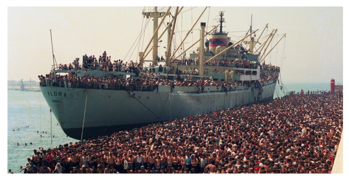
Photo: The Vlora alongside the quay in Bari, 8th August 1991.