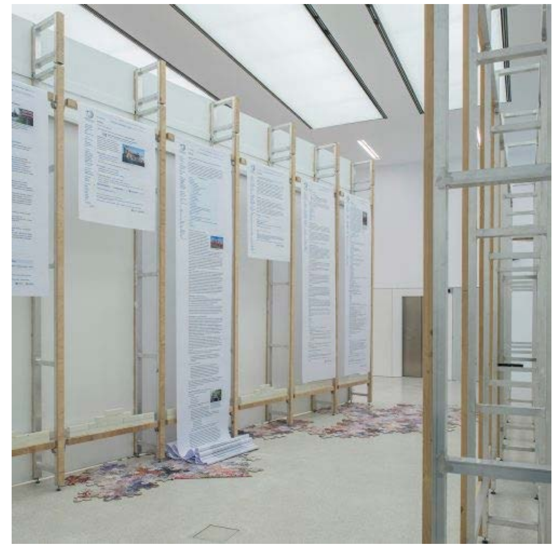
Installation view.