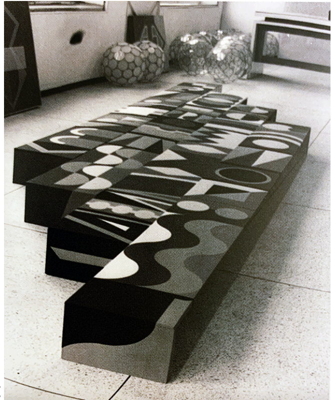
Modern research based on traditional elements. 1971

Indeed, the Arab artist who begins to revisit his training, thereby reaching – as we have already pointed out – a maturity to which he will have devoted his creative potentials, is making a return to his own plastic heritage. The latter is in no way embodied in easel painting, but rather appears in the popular arts, in cities and in the countryside, in the form of drawings, wood or plaster engraving, etc. It would be a mistake to consider that this craftsmanship is exclusively decorative, because they are expressions of plastic values whose immense wealth was the subject of an awareness by painters. As such, it seems important to me to cite the experience of a group of Moroccan painters from the School of Casablanca and which is currently referred to in critical or historical writings by the "Casablanca Group" or the "Group. 65 ".