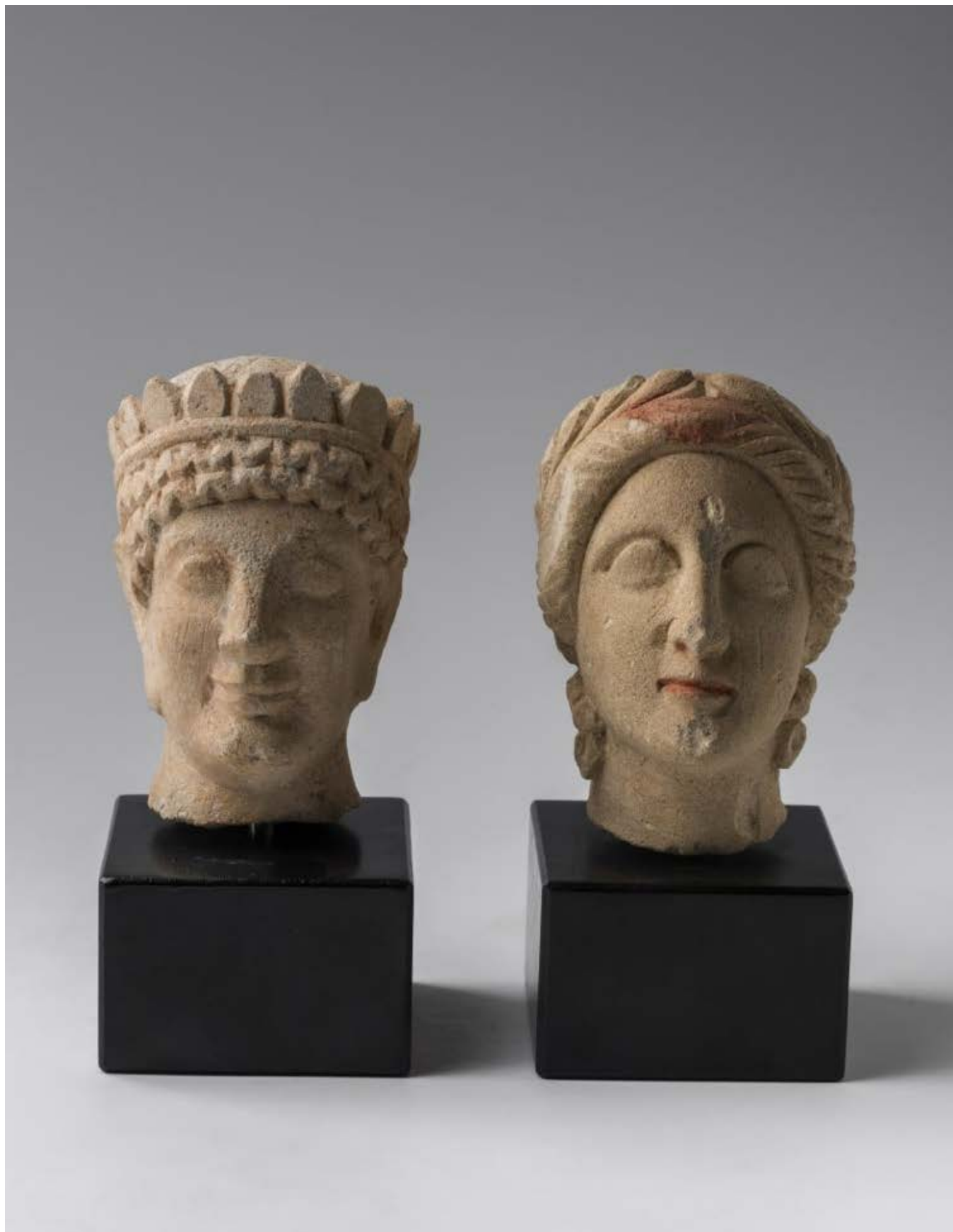
Statuetta di Apollo/Dioniso Marmo, h. 34,5, l. 10,5 cm, p. 6 cm. Provenienza sconosciuta, I-II secolo d.C. Torino, Musei Reali – Museo di Antichità, Inv. 50780 (© Musei Reali Torino).