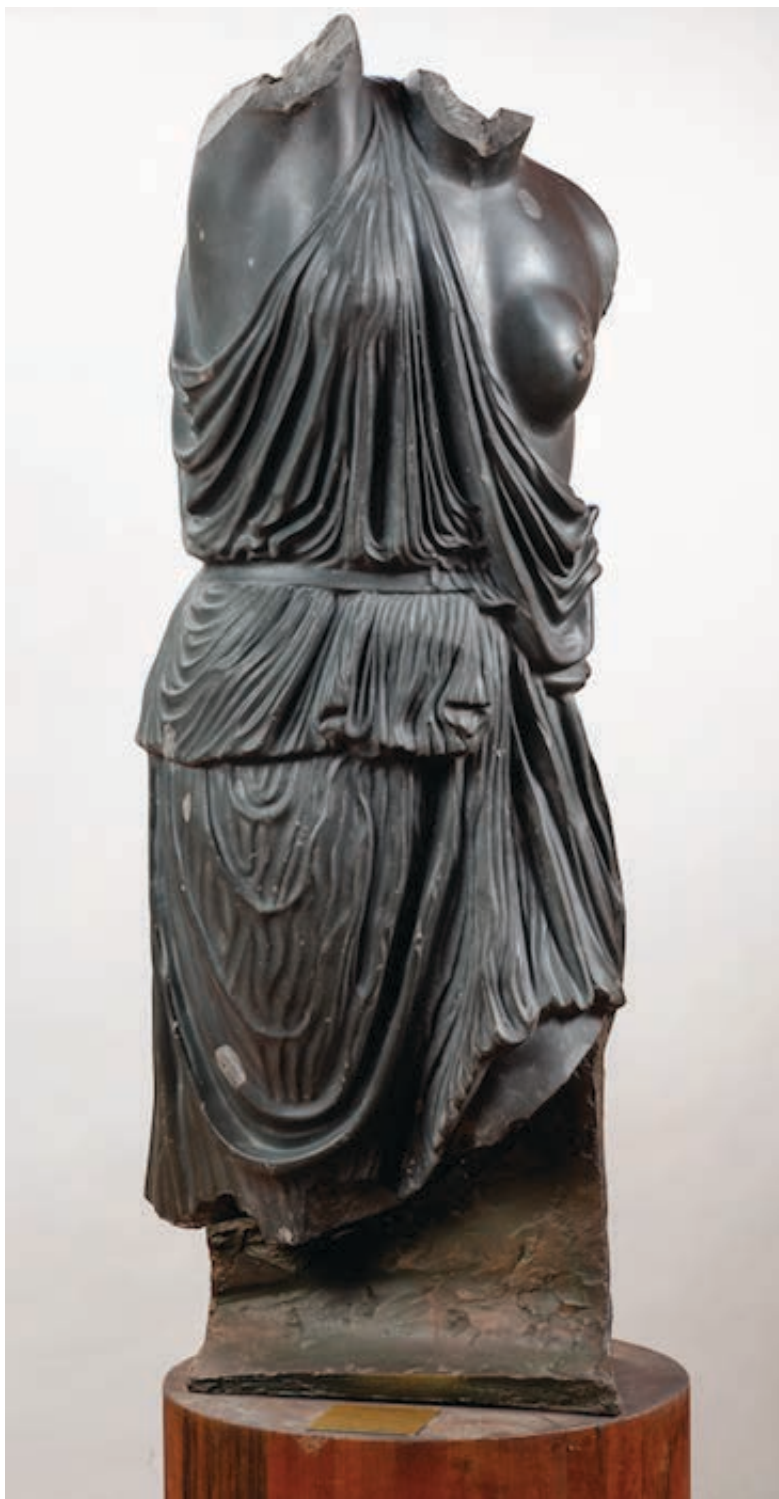
Torso di Amazzone di tipo fidiaco. Basanite verde scuro, h. 90 cm . Copia di I secolo d.C. da originale del 440-430 a.C. Musei Reali – Museo di Antichità, inv. 284