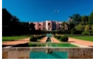
Serralves Villa and Central Parterre Carlos Vilela