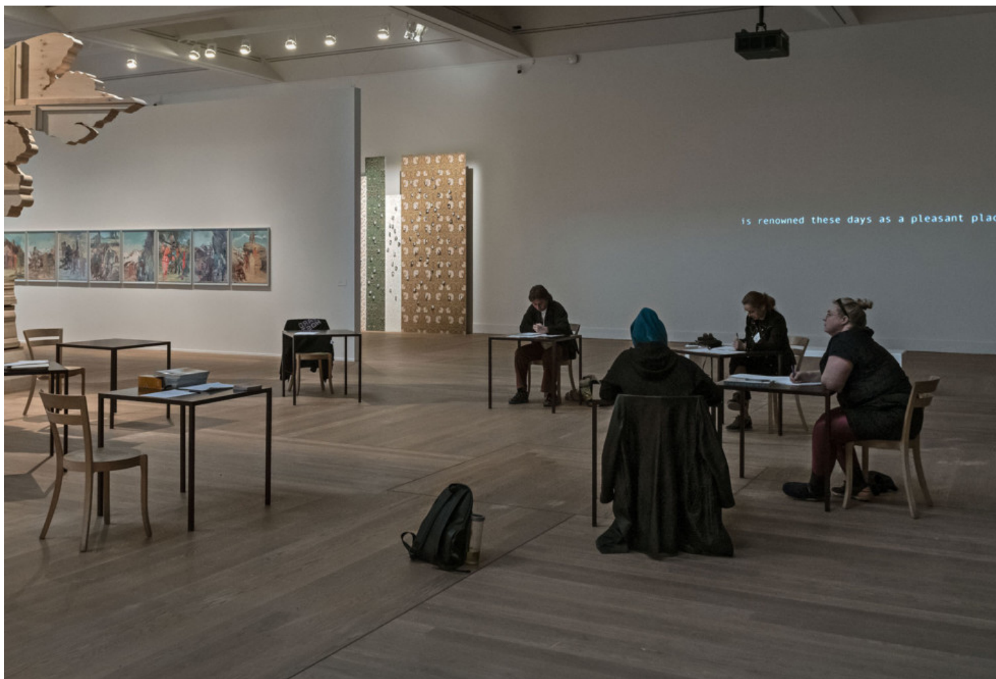
The museum hosts during a workshop in the exhibition "Walid Raad: Let's be honest, the weather helped", 2020