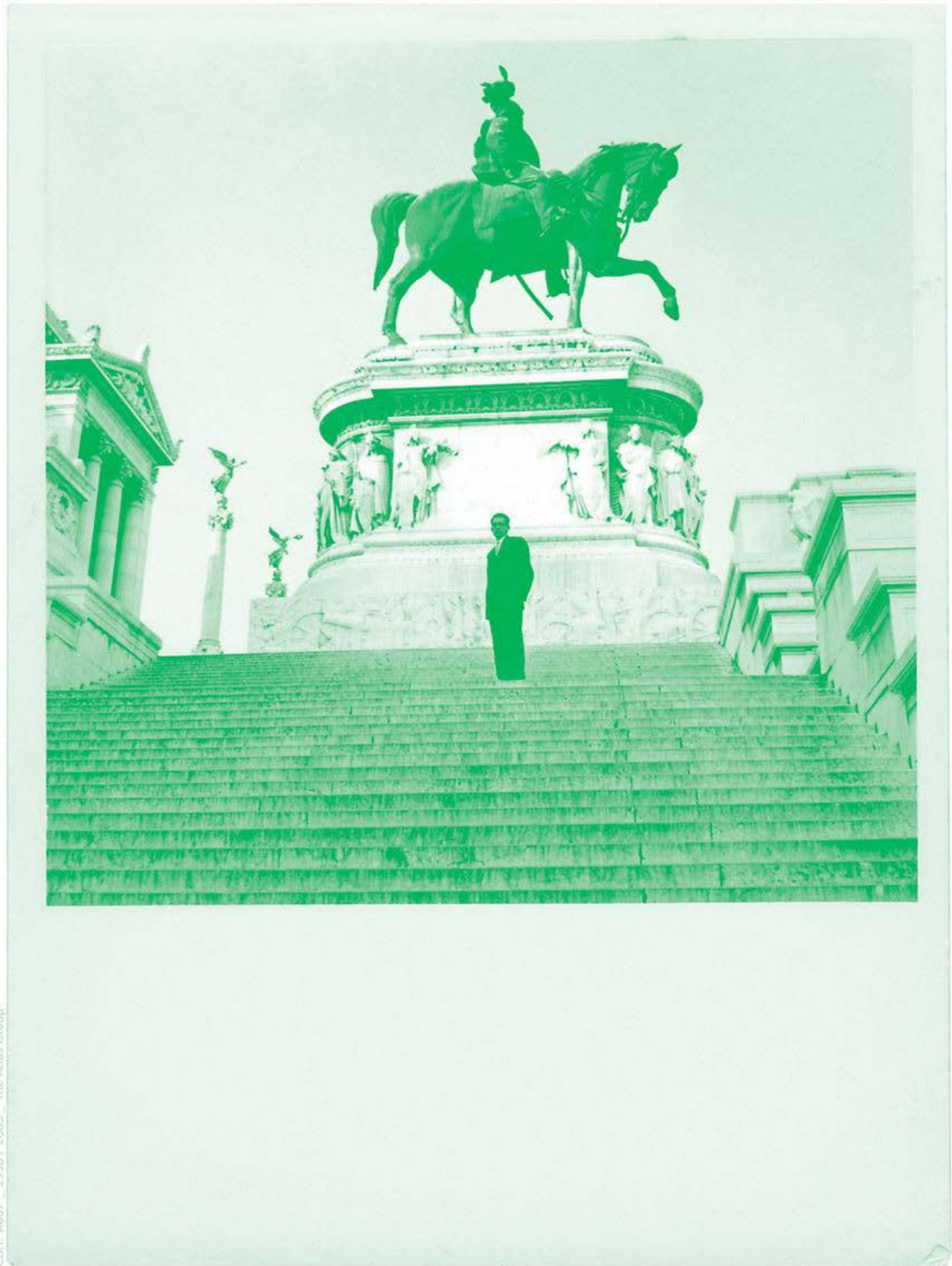
CDH: A867 / 1958 / 2003 The Atlas Group