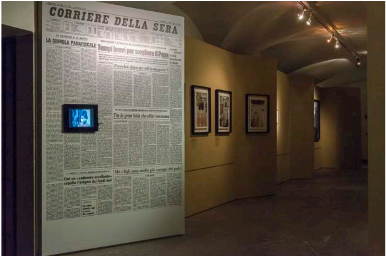
Too early, too late. Modernity and Middle East, Installation View, curated by Marco Scotini, Pinacoteca Nazionale di Bologna, 2015.

technical know-how, but also their ideology, from Europe. As with Bellini, the representation is not neutral, we have to double check the meaning, because of the Western political agency disclosed under the representation. Thus the representative politics and the politics of representation are spread by the form and are interfaced with the meaning.