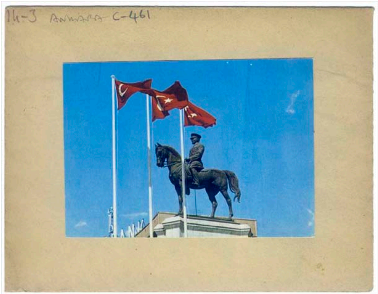
Vahap Avşar, Baskomutain, Chief Commander, 2011, C-Print.

In parallel, Vahap Avşar also deals mostly with archive and archival material. With his work Chief Commander , the artist allows me to recall Gentile Bellini with his work about the representation of power. Chief Commander is a series of seven large-scale photographs of popular Turkish postcards depicting monumental statues of Atatürk. The statues, the earliest ever made of Atatürk, were produced by two European sculptors in 1920: Heinrich Krippel and Pietro Canonica. As it happened for Mehmed II, an Eastern government turned to Europeans for the representation of Atatürk, as there were no Ottoman or Turkish artists available to produce images and statues, since the representation of the human form is forbidden in Muslim culture. Vahap Avşar seems to assume that if Atatürk is pictured as Chief Commander, instead of Father of the Nation, it is because these European sculptures not only bring their