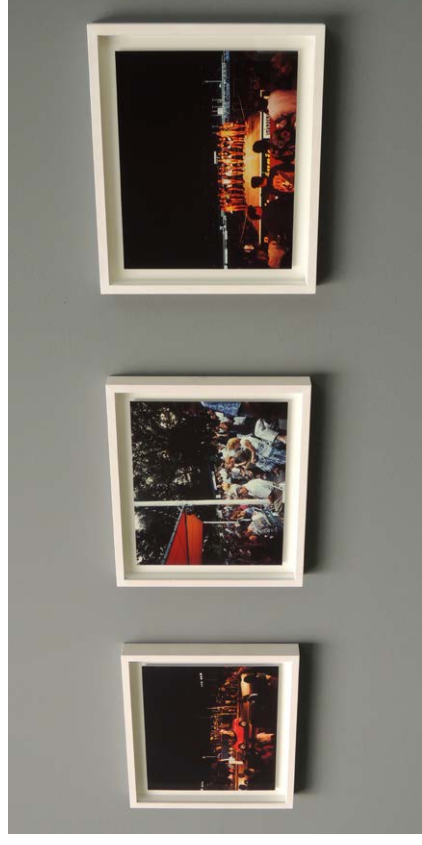
Fig. 14. Bruno Serralongue, 4ème Concours d'élégance de voitures, 30 juillet 1994; Fête du Château, 1er août, 1994; Élection de Miss Hippodrome, 10 août 1994