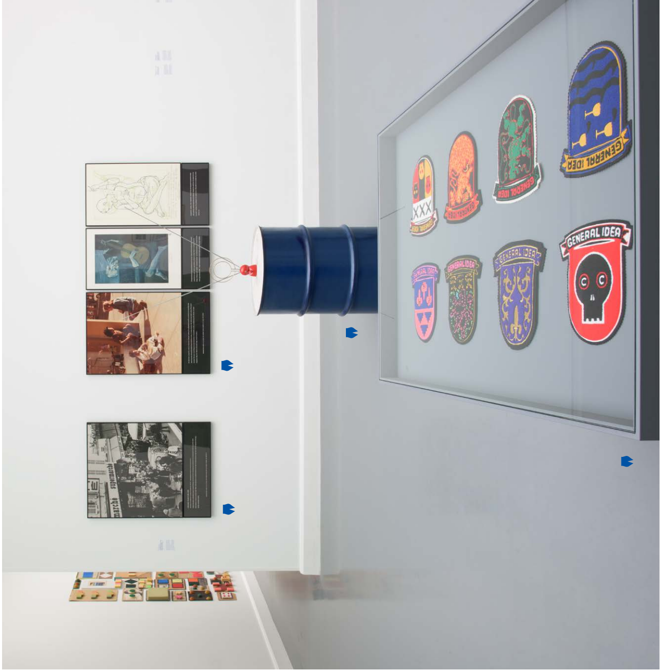
Fig. 6. Room 1