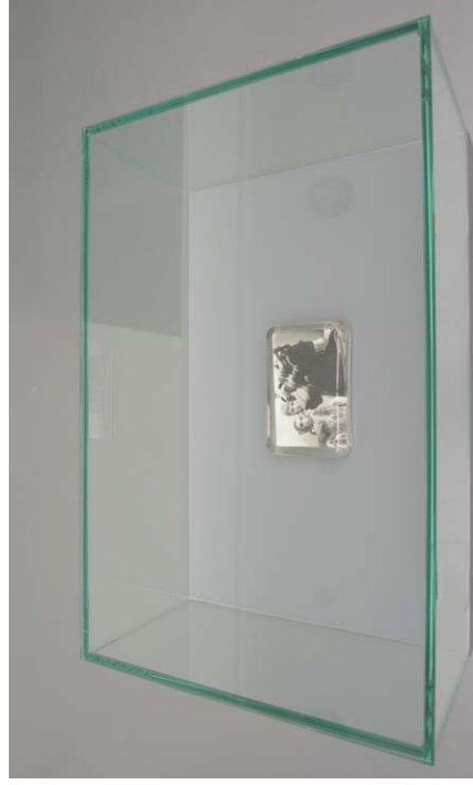
Fig. 4 Louise Lawler, Presse-papier Sans titre

FRAC Poitou-Charentes, Angoulême Colonial Tea Cup , 1983-1994 Paul McCarthy (1945, Salt Lake City US)