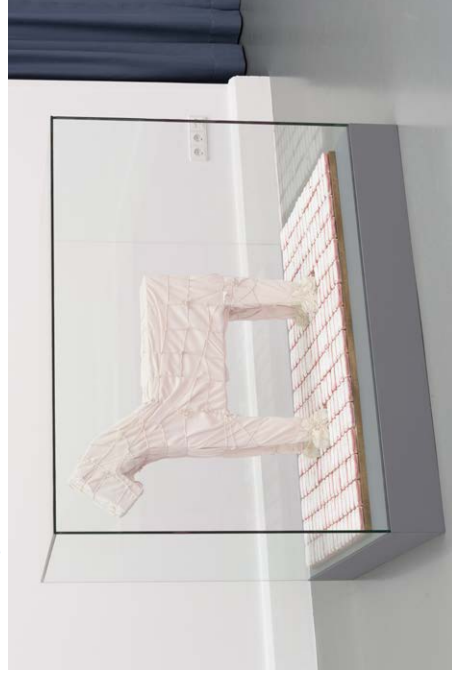
Fig. 21. Raymond Hains, Le Cheval de Reims

FRAC des Pays de la Loire, Carquefou Miseen Scène , 1991 Renée Green (1959, Cleveland US)