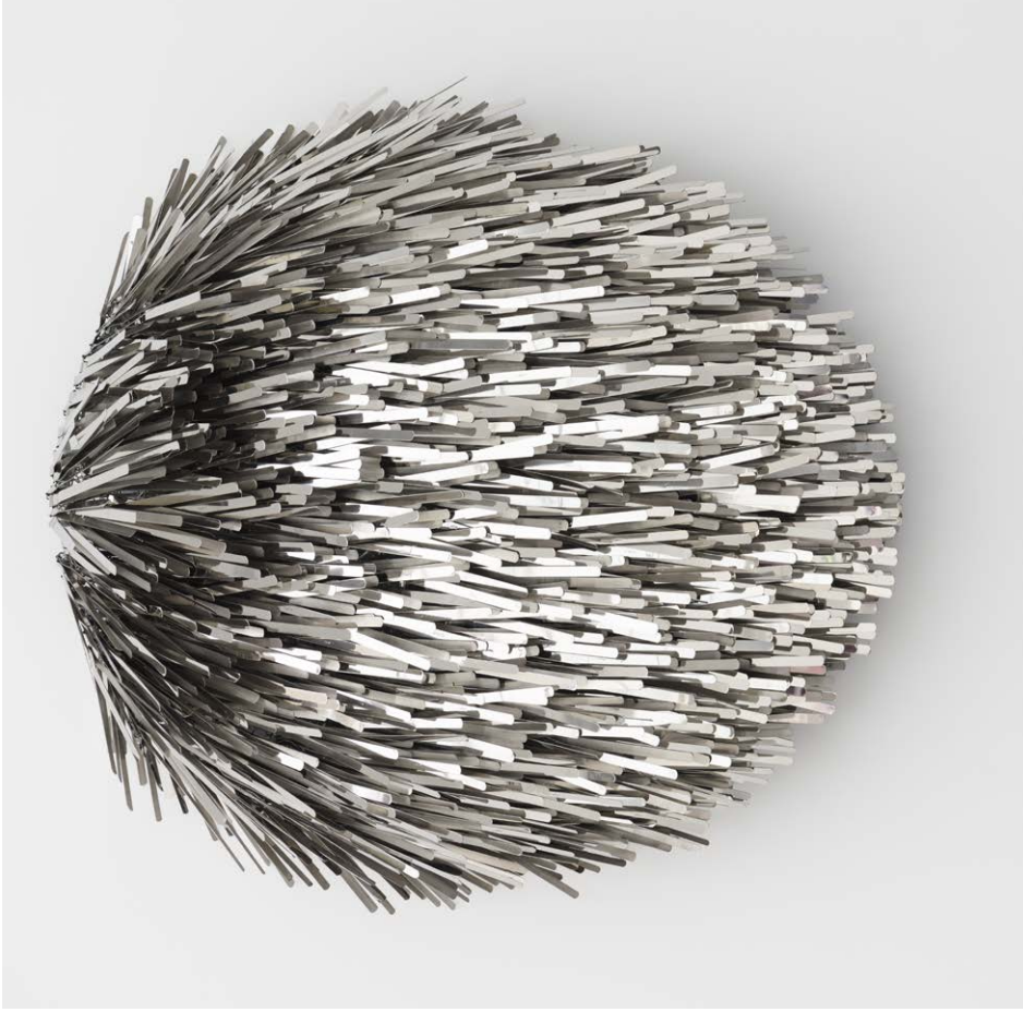
Fig. 37. Subodh Gupta, Thing

FRAC Provence-Alpes-Côte d'Azur, Marseille The Constallation n° 4-7, 2011 © Adagp, Paris, 2015 Bouchra Khalili (1975, Casablanca MA)