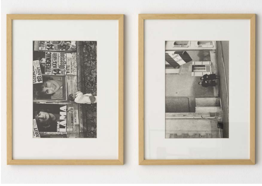
Fig. 3 Henri Coldeboeuf, Ostensions