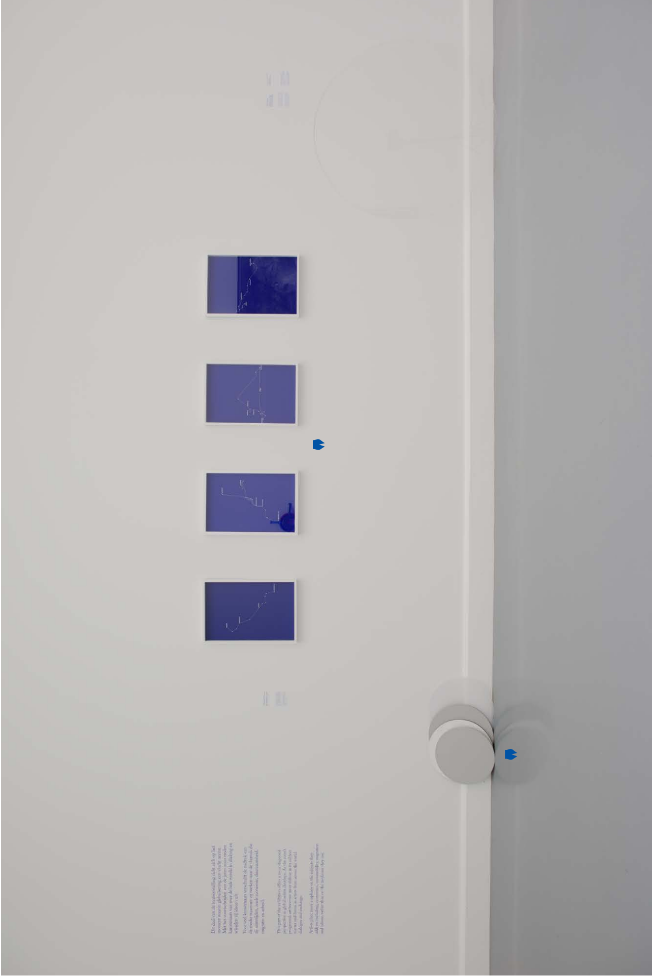
Fig. 35. Room 11