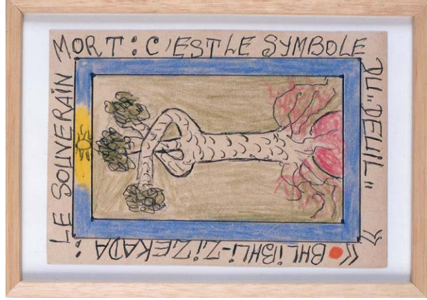
Fig. 34. Frédéric Bruly Bouabré, Untitled , July 2000, collection FRAC Île-de-France, (c) all rights reserved. Photographie : Marc Damage.

FRAC Nord-Pas de Calais, Dunkerque Ronds Sur le Sol , 1999 Joëlle Tuerlinckx (1958, Brussels BE)