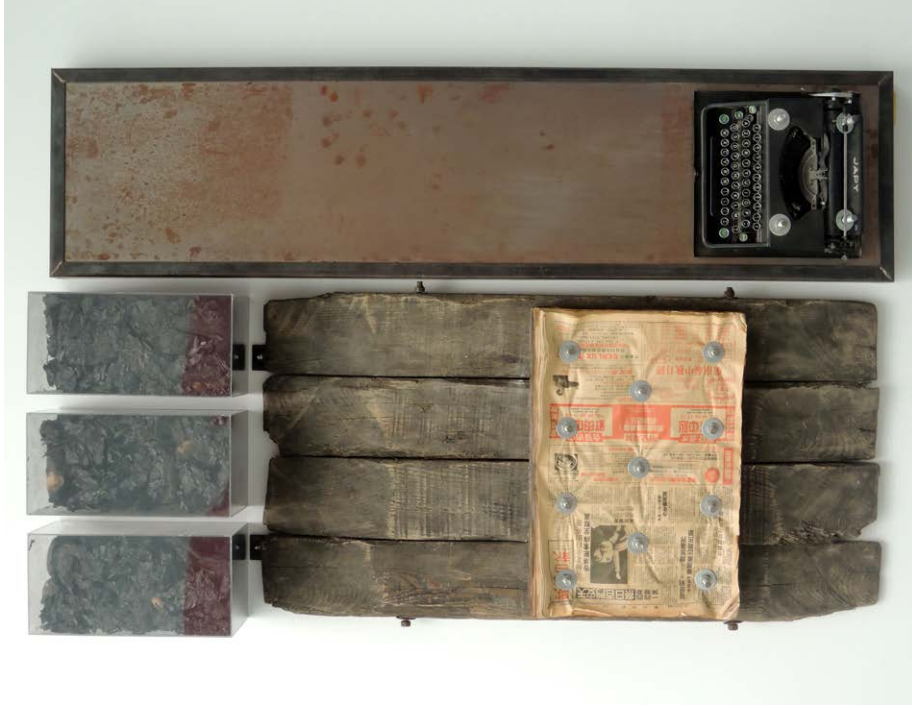
Fig. 9 Chen Zhen, L'information condensée/ L'écriture bloquée