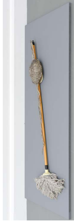
Fig.10 Huang Yong Ping, Balai Laveur

FRAC Alsace, Sélestat L'information condensée/L'écriture bloquée, 1990 © Adagp, Paris, 2015 Chen Zhen (1955, Shanghai CN - 2000, Paris FR)