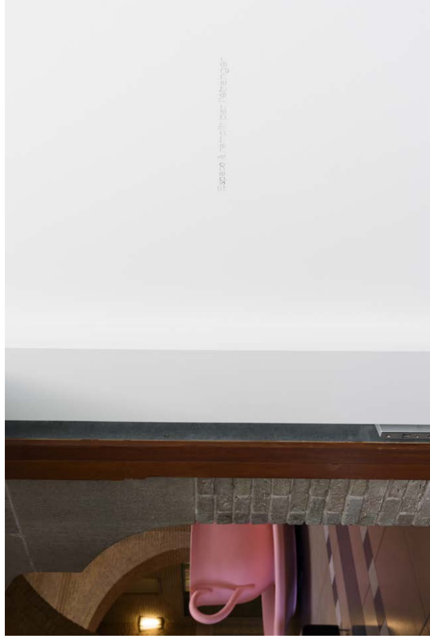
Fig. 40. Room 12

FRAC des Pays de la Loire, Carquefou Some Objects Blackened and a Body Too , 2011 Lili Reynaud Dewar (1975, La Rocheille FR)