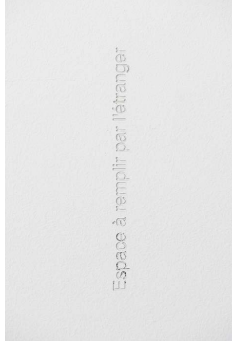
Fig. 41. Latifa Echakhch, Hospitalité