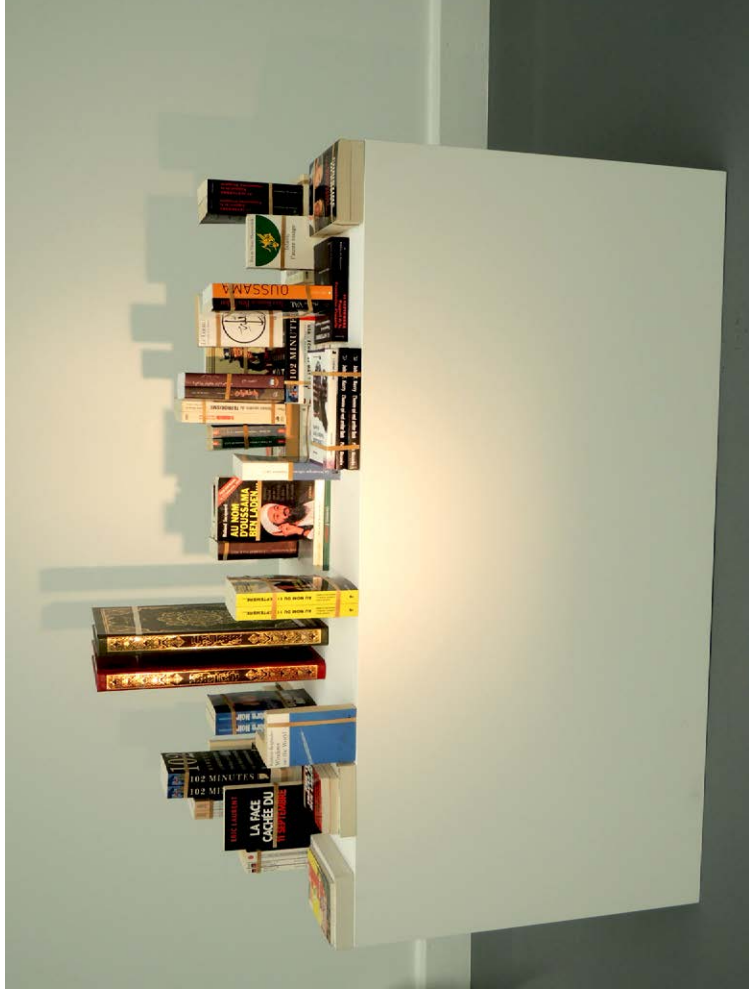
Fig. 29. Mounir Fatmi, Save Manhattan 01 . © Adagp, Paris, 2015