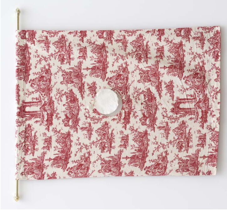
Fig. 19. Renée Green, Miseen Scène , detail