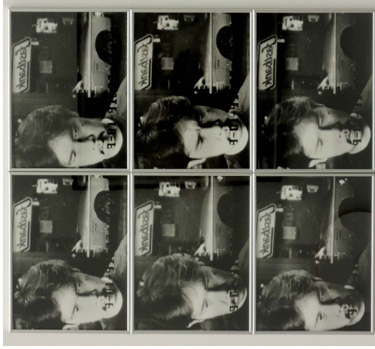
Fig. 30. Sophie Calle, Unfinished - Cash Machine © Adagp, Paris, 2015

FRAC Basse-Normandie, Caen Unfinished - Cash Machine, 2003 © Adagp, Paris, 2015 Sophie Calle (1953, Paris FR)