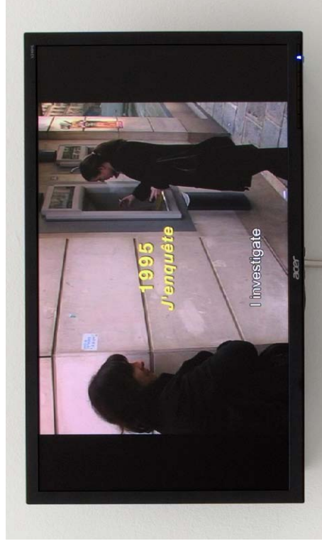
Fig. 31. Sophie Calle, Unfinished - Cash Machine © Adagp, Paris, 2015