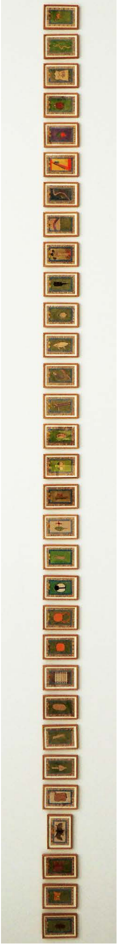
Fig. 33. Frédéric Bruly Bouabré, Untitled

Fracpicardie / des mondes dessinés, Amiens New Born, New Life , 2007 © Adagp, Paris, 2015 Yan Pei-Ming (1960, Shanghai CN)