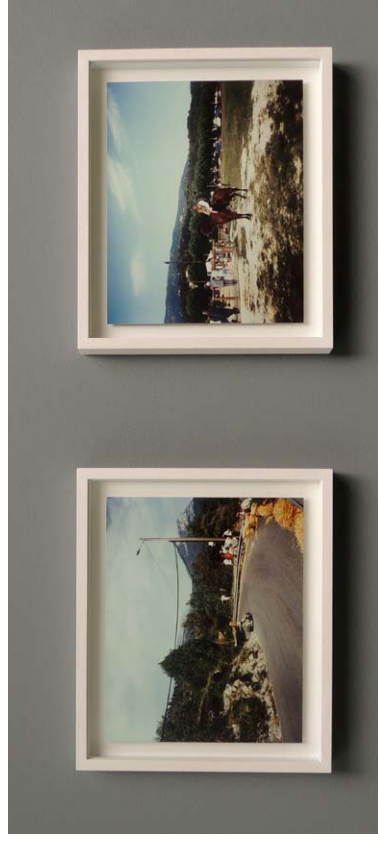
Fig. 13. Bruno Serralongue, Courses de Karts, 10 juillet 1994; Fête du Cheval, 10 Juillet 1994