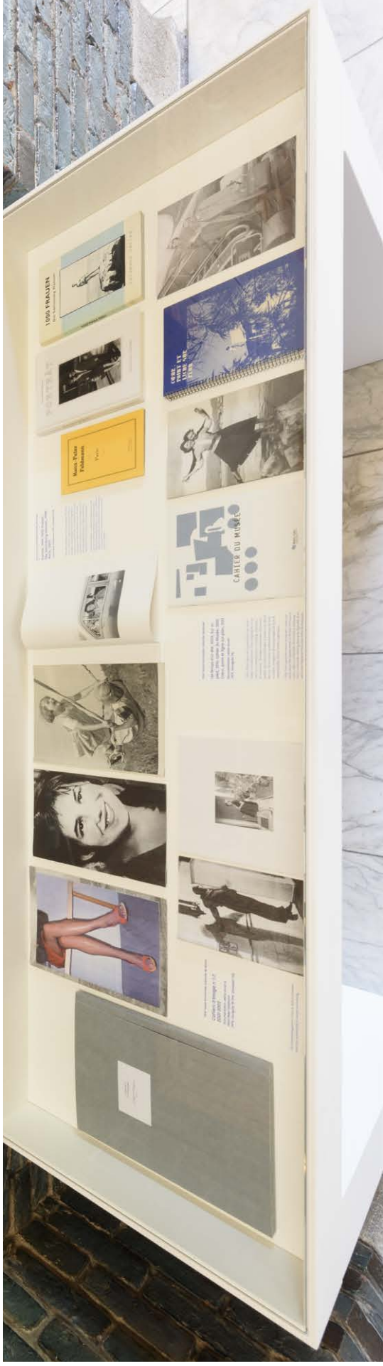
Fig. 42. Bibliothèque Fantastique