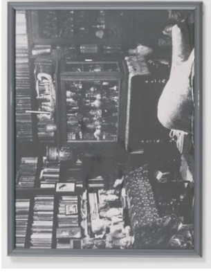
Fig. 20. Dominique Gonzalez Foerster, Photograph of Sigmund Freud's home. Cabinet de Pulsions

FRAC Champagne-Ardenne, Reims Le Cheval de Reims , 1998 Raymond Hains (1926, Saint-Brieuc FR - 2005, Paris FR)