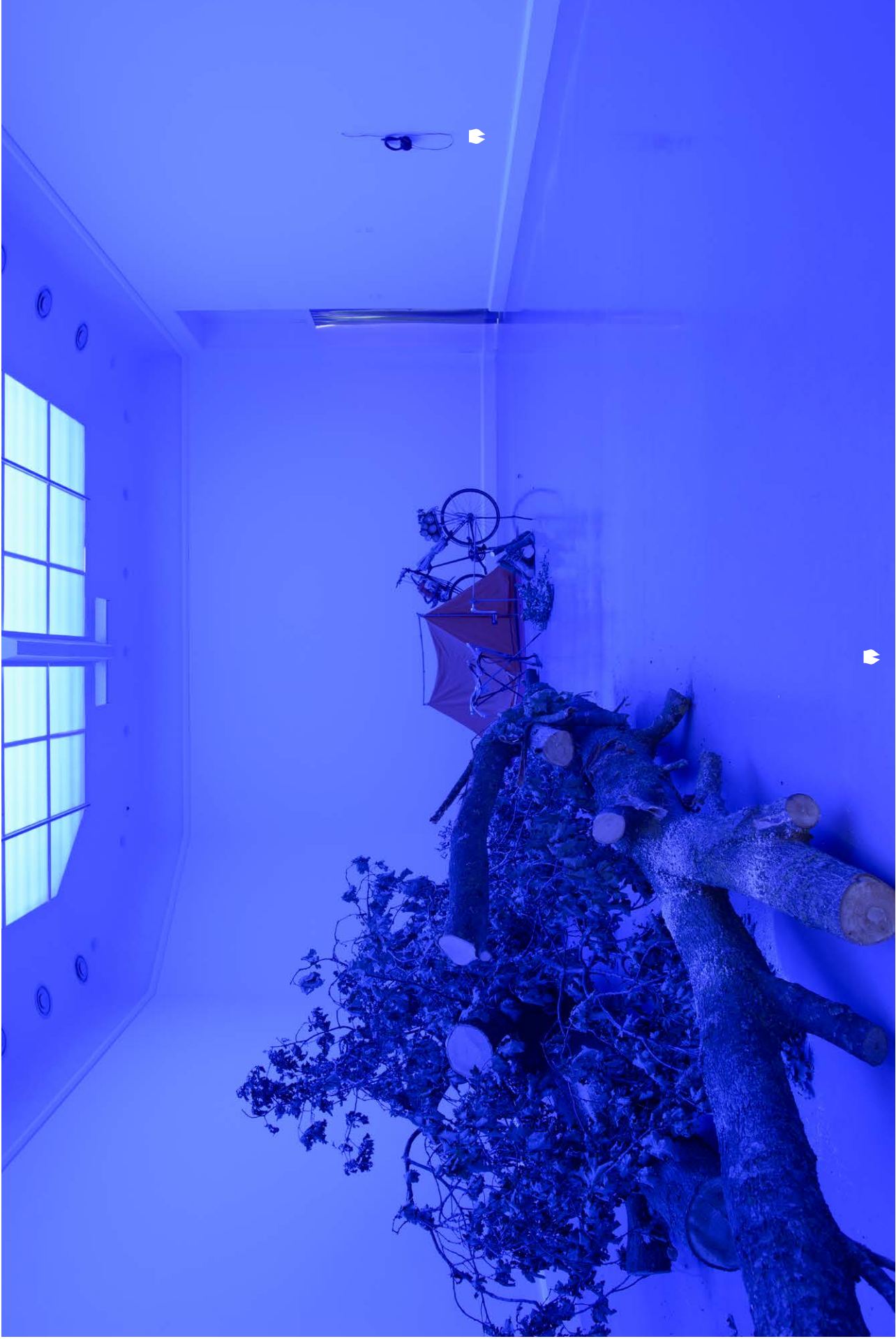
Fig. 23. Room 9