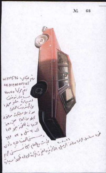
Plate 68 Volvo Brown March 8, 1986 13:00 8 injured 3 killed 53 injured 25 kg. of TNT

Plate 69 Renault 5 White March 25, 1986 13:04 8 killed 53 injured 25 kg. of TNT Hexogen 0.4 m. x 0.8 to 1.25 m. crater