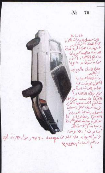
Plate 70 Renault 5 White April 8, 1985 13:04 11 killed 90 injured 75 kg. of TNT Hexogen