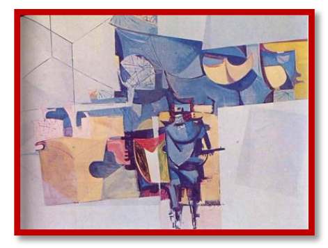
EUROPEAN ACADEMIC RESEARCH - Vol. V, Issue 8 / November 2017