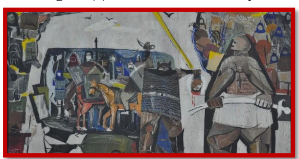
Figure (1): Name of work: Martyr