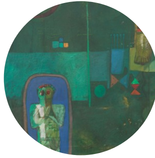
SUMERIAYAT Dia Azzawi IRAQ