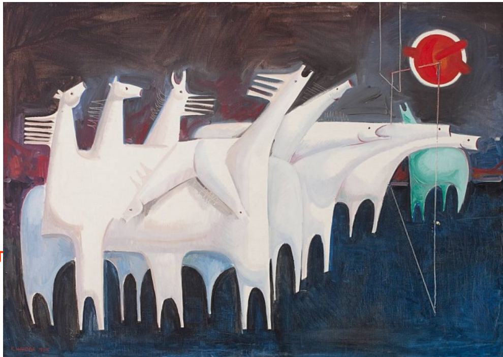
Fatigued Ten Horses Converse with Nothing (The Martyr's Epic), Oil on canvas 91 x 127 cm