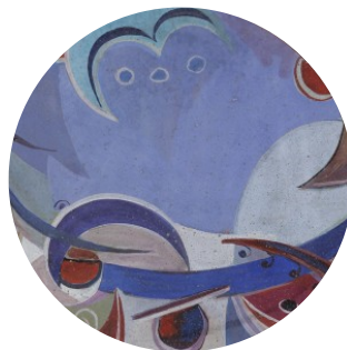
UNTITLED Madiha Omar IRAQ