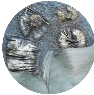
COMPOSITION Saleh Al Jumaie IRAQ