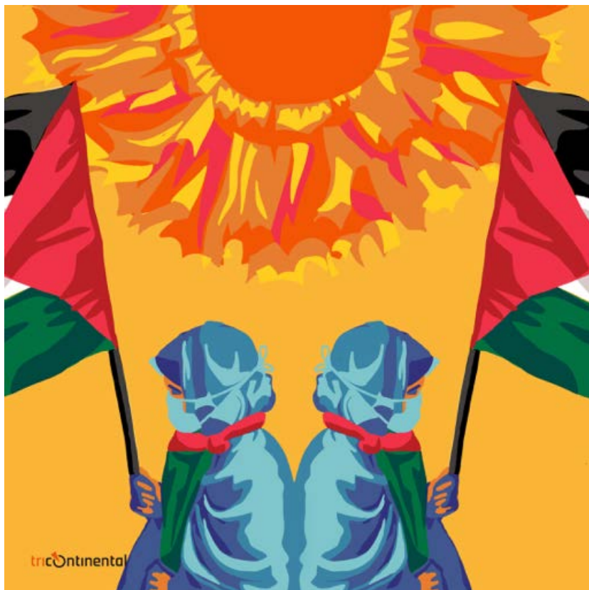
Palestine , inspired by the original poster of Ronaldo Cordova (OSPAAAL, Cuba), Solidarity with Palestine , 1968.

tilt, always afraid of the settler's bullet or the soldier's handcuffs. Prison walls are made of stone. Settlement walls are made of stone. But the walls of the homes of a Palestinian are made of that odd combination of fear and resistance. There is fear that the cannons of the coloniser will blast through them, but there is resistance that acknowledges that the walls of the home are not the real walls. The real walls are the walls of fortitude and perseverance.