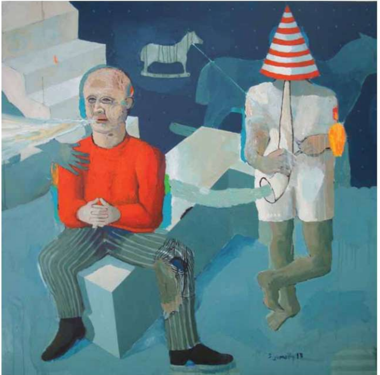
© Saddam Jumaily

SACRED TIPS Acrylic on Canvas 140 X 140 cm, 2013